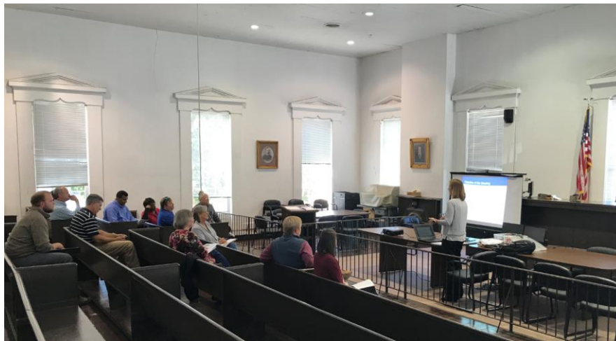
Abiaca Creek Levee LAMP Project Meeting in Carrollton, MS.

Red indicates next planned or scheduled event or meeting.