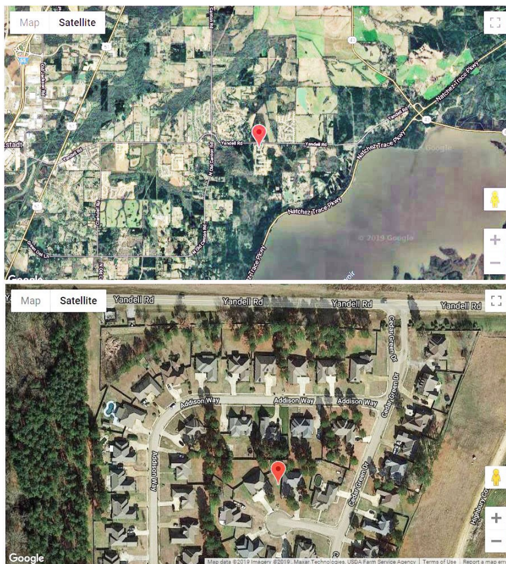
Figure 1. Location of August 9, 2019, earthquake epicenter on the northwest side of the Ross Barnett Reservoir (top) and in a community south of Yandel Road (bottom).

The earthquake epicenter was in a residential area off Yandell Road on the northwest side of the Ross Barnett Reservoir (Figure 1).