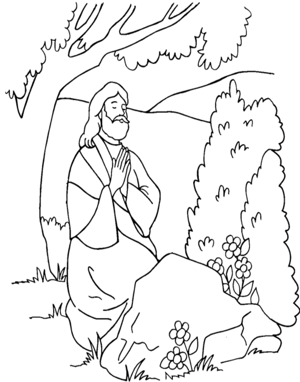
Jesus Prays for All Believers