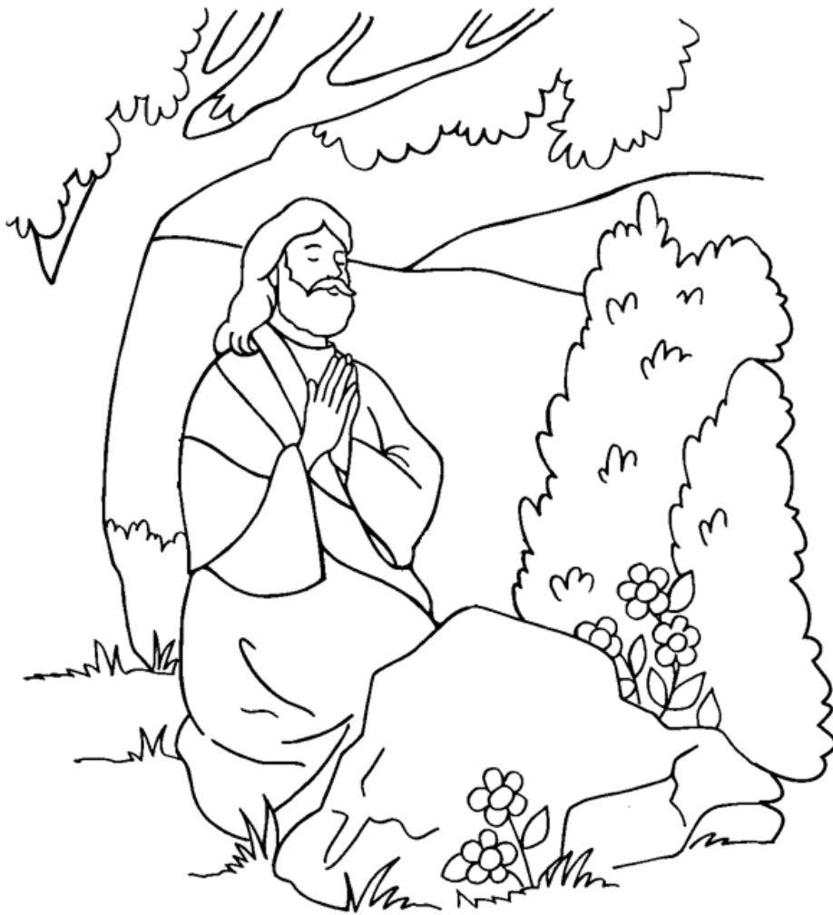
Jesus Prays for His Disciples