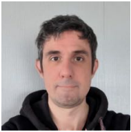
DAVID NIELD Contributor, DIY

If you come across someone else's iPhone during an emergency, on the lock screen when the PIN pad appears, tap Emergency and then Medical ID . You can also use this method to call 911 from a locked iPhone, and to double-check how your own medical details appear when someone else accesses them.