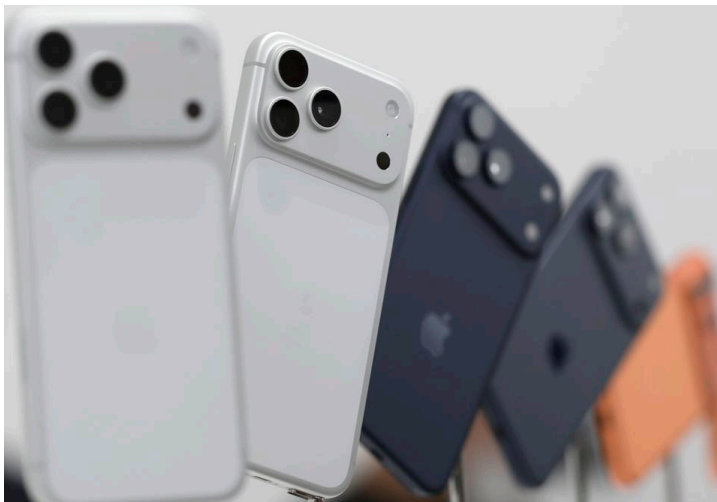
Do not stop these updates.

Apple has now released iOS 26.1. All eligible iPhone users are urged to update now , with a raft of critical new security fixes mixed in with enhancements to Liquid Glass, Alarms and Apple Music. Go to Settings > General > Software Update. Do this now.