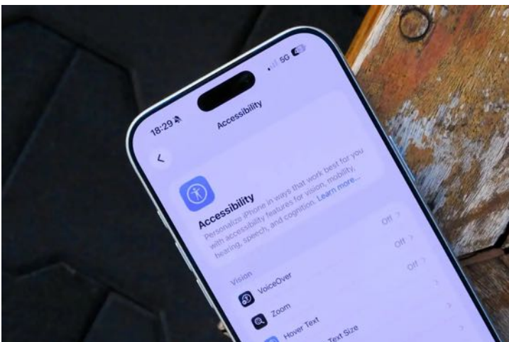
iOS 26.4 includes several new Accessibility settings.

Updating to iOS 26.4 also brings some welcome accessibility improvements. For instance, the system now includes a new “Reduce Bright Effects” toggle that minimizes intense flashes when interacting with certain interface elements. Apple has also made it easier to access and customize subtitles and captions directly from the media player interface.