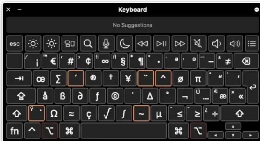
The 'hidden' keys on a U.K. Apple keyboard.

Before we begin, this is a handy overview of the hidden characters that you can type using Alt. The first example is the U.S. keyboard, the second is a U.K. keyboard. If you want to see an overview of a different keyboard on your screen we'll include the steps to see it below.