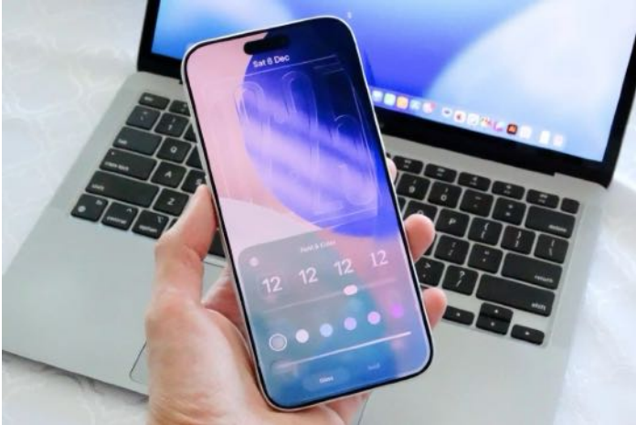
iOS 26.2 lets you adjust the Liquid Glass intensity on the Lock Screen. Foundry

After listening to user feedback, Apple added a new option to iOS 26.1 that lets users choose between the traditional Liquid Glass look and a “Tinted” mode that makes everything more frosted. Now with iOS 26.2, there’s also a similar adjustment for the clock on the Lock Screen.