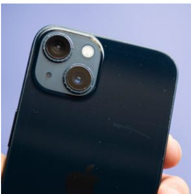
The iPhone 13 from Gazelle had scratches around the edges of its cameras, plus gunk stuck in the edges of the phone.

previous owner caked in the bottom speakers, earpiece, and ring/silent switch on the left side of the phone.