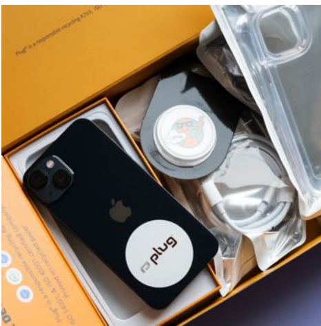
Plug also ships its phones with an extra accessory, which can be a case, a phone grip, or extra chargers.

Plug provided the best packaging of the refurbished-phone sellers, tossing some accessories into the box that we didn't expect, which made the experience feel like opening up a new product. Plug shipped the phone with three chargers, a clear phone case, and an adhesive phone grip (like a knockoff PopSocket). The phone was also well protected, shipped in a smaller box inside the accessory box; some other phones we received were stuffed in a small box in a flat mailer, so this is a clear win for Plug.