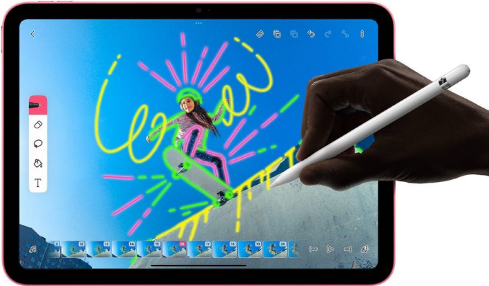
iPad 10 has a USB-C port and works with the Apple Pencil USB-C.

The 10.9-inch iPad is popular for an obvious reason: It costs only $349. That's less than a third the price of the cheapest MacBook. Even adding a click-on keyboard and trackpad to let the tablet convert to a laptop still puts it about half the cost of a MacBook.