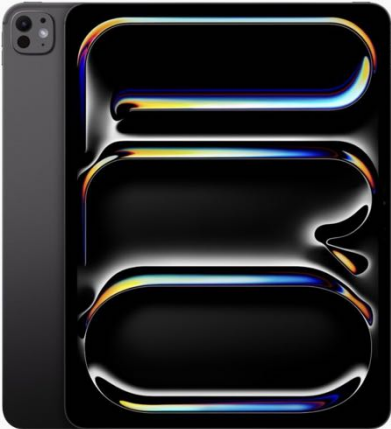
The M4 iPad Pro is surprisingly slim and light. Photo: Apple

People who make a tablet their primary computer generally choose iPad Pro because it's Apple's most powerful, with the best-looking display. Someone using a computer all day doesn't want to make compromises. And it's not just professionals: this is the best-selling iPad model by a wide margin.