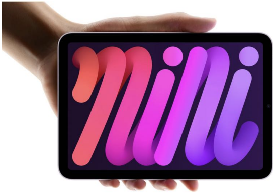
iPad mini 7 fits in your hand. Photo: Apple

The best computer is the one you have with you. A 16-inch laptop isn't very useful if it's so bulky you don't carry it around much.