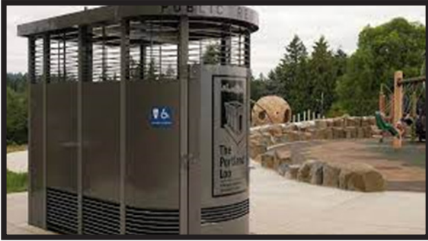
The Village is looking at the design of the Portland Loo as the prototype for a community restroom in Oak Park.

The Village of Oak Park is looking at options for a community restroom to benefit public health and reduce the strain on local businesses that allow access to their facilities. The community restroom is intended to be a service for residents, tourists, commuters and individuals experiencing homelessness. Plans, which are subject to Village Board approval, call for the public restroom to offer 24/7 access to an ADA compliant restroom facility with a changing table and a sharp object disposal box. The final location of the community restroom is intended to be in a public area near public transit, local businesses and parks to benefit the community, deter crime and reduce waste in common areas.