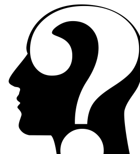
Director of Programs