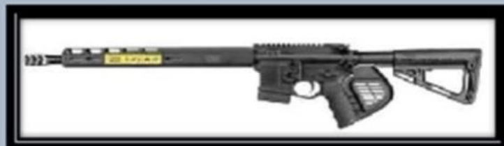
SIG SAUER M400 RIFLE