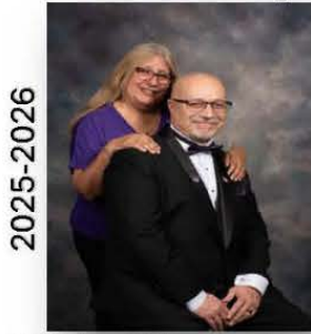
2025-2026 ER Final Message & February Recap