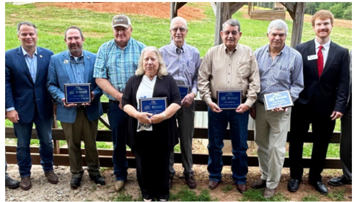
2025 Award Recipients

The Greater Hall Chamber, Hall County Farm Bureau, and UGA Extension Hall County's Annual AgriBusiness Awards program increases recognition and appreciation of the agribusiness and agricultural community in Gainesville-Hall County. Recognition awards will be presented at the Awards Breakfast on April 15 and is free and open to the public.