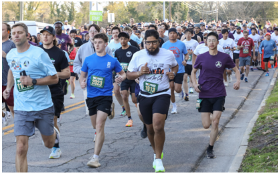
Over 950 runners and walkers participated.