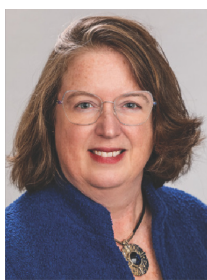
Dr. Margaret Ryder Lanier Technical College