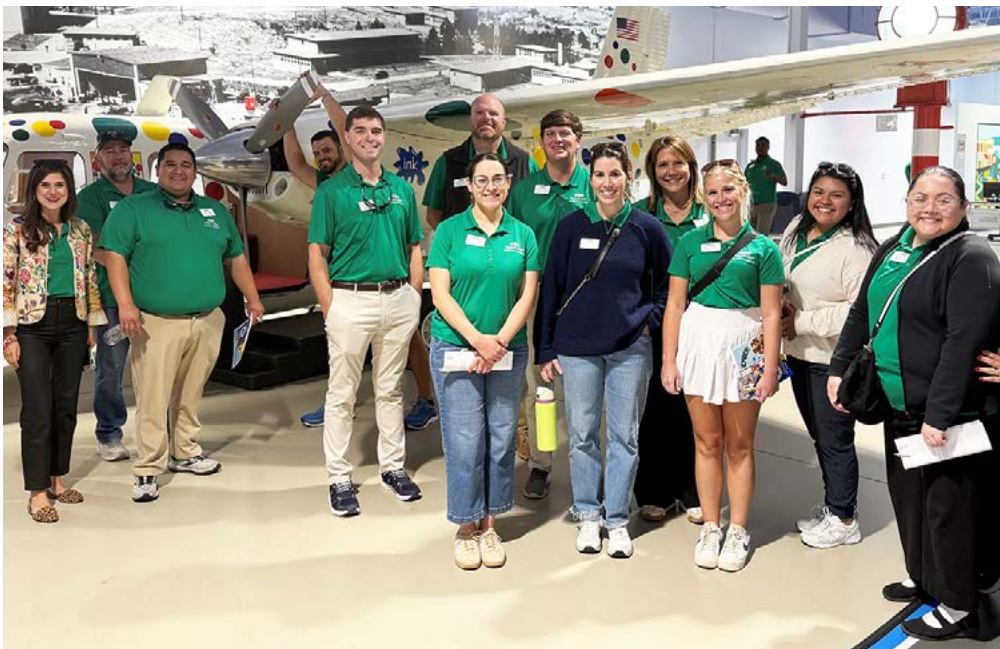
Leadership Hall County 2026 Class Members at INK (Interactive Neighborhood for Kids) in Oakwood as part of the Quality of Life Day. The class also visited the Atlanta Botanical Gardens Gainesville, The Quinlan, and the Georgia Mountains YMCA as part of the program.