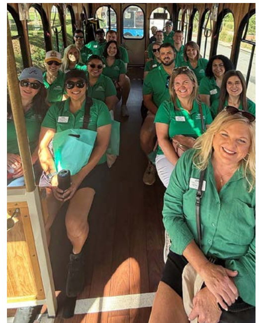
The Leadership Hall 2026 Class rode the Gainesville Trolley as part of the Gainesville-Hall County History Day program.