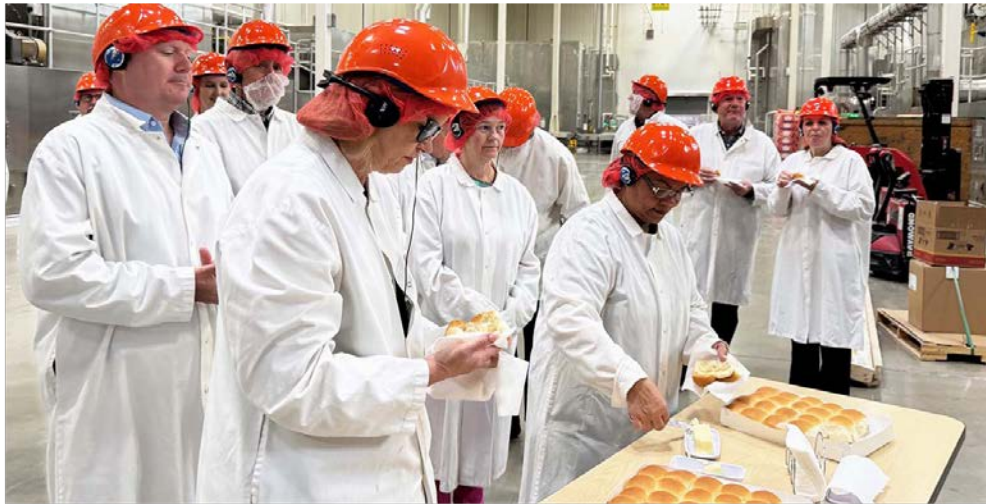
The South Hall Business Coalition recently met at King's Hawaiian for an overview and tour of the bakery, followed by a tasting of the sweet rolls fresh from the oven.