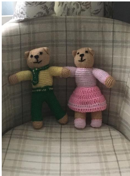
Jack and Jill – the Crisis Bears!!!