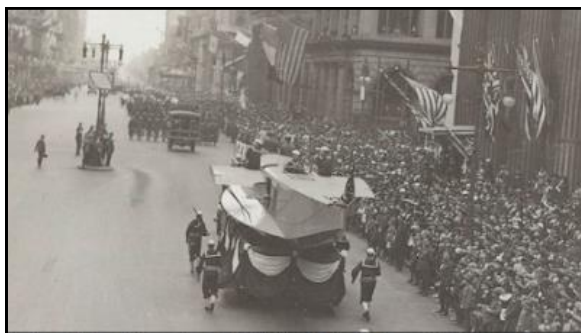
Philadelphia Liberty Loan parade in 1918