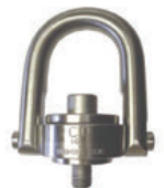
Stainless Steel Swivel Hoist Ring SS-125 and SS-125M

The new Crosby SL-150 Slide-Loc® is a great addition to the family of products that include our standard engineered hoist rings, our Heavy Lift "forged bail" hoist rings, and hoist rings for cold temperature applications, just to name a few.