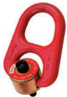
Heavy Lift Swivel Hoist Ring HR-1000 and HR-1000M