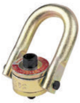
Swivel Hoist Ring HR-125 and HR-125M