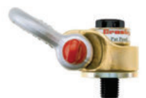
Side Pull Hoist Ring HR-1200 and HR-1200M