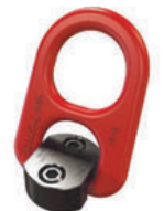
Pivot Hoist Ring HR-100 and HR-100M