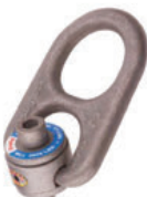
Heavy Lift Swivel Hoist Ring HR-1000CT and HR-1000MCT