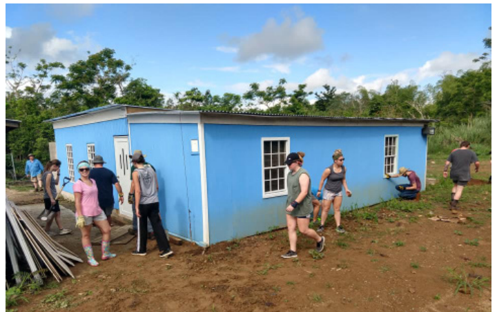
2019 Mission Trip To Puerto Rico