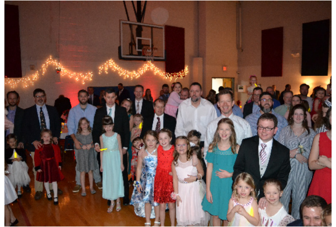
(2019 Father/Daughter Dance)