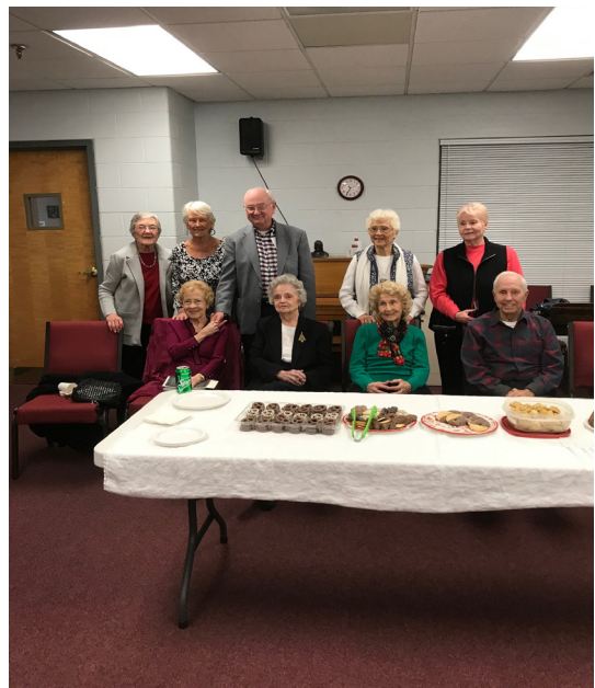
Members of Christian Fellowship Sunday School Class

So, to younger church members, as the church's "Greatest Generation" lays down its earthly burdens, be grateful for your freedom, won at a great cost. Remember the old folks fondly. Please visit, send cards, be patient, hold the door open, and greet them warmly (but speak louder). This class made things better for so many who followed. Go and do likewise.