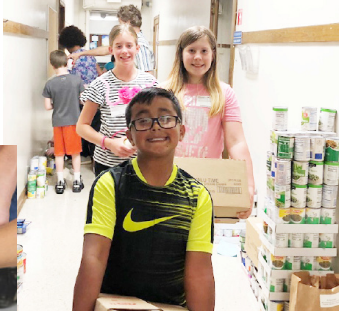
Kids Can For Christ 2019