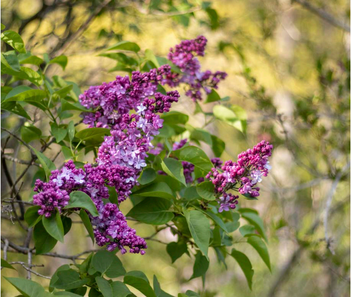
Lilacs ( Syringa vulgaris 'Henri Martin') at the Arnold Arboretum.

fluctuations are particularly hard on introduced flora during spring and fall, when biorhythms can be out of sync with steppe weather.