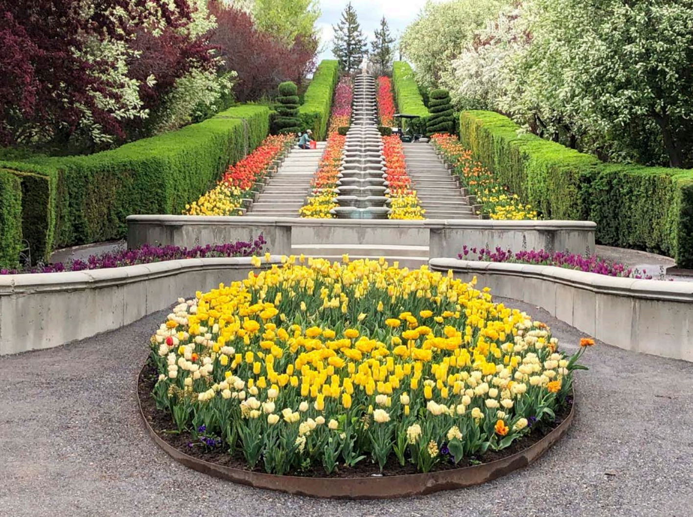
A horticulturist works amidst a tulip display at Ashton Gardens.