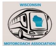
Wisconsin Motorcoach Association