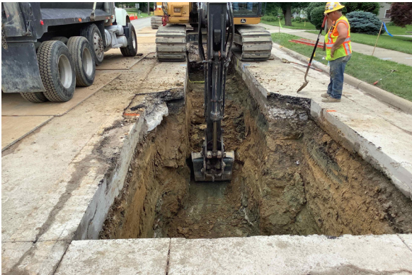
Construction on Glendale Milford Road in Evendale.

Construction is underway in front of Summit Park in Blue Ash as well as on Glendale Milford Road and Evendale Commons Drive in Evendale. We expect to begin work in Amberley Village, Golf Manor and Cincinnati in mid-to-late August.