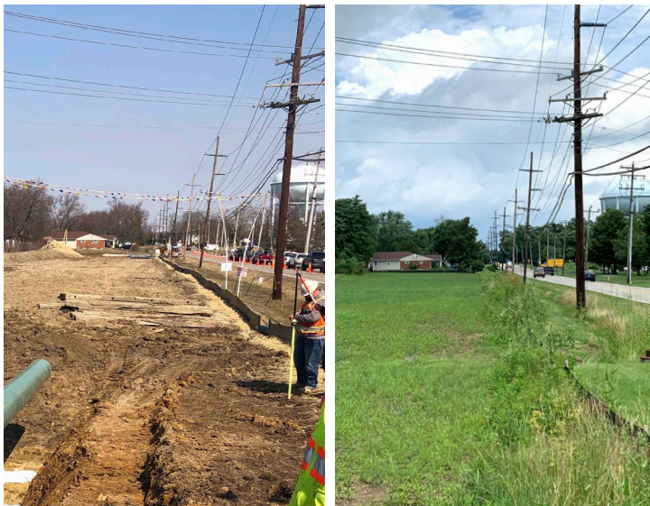
Photos of Francis RecreAcres on Conrey Road during pipeline installation (left) and after restoration (right).