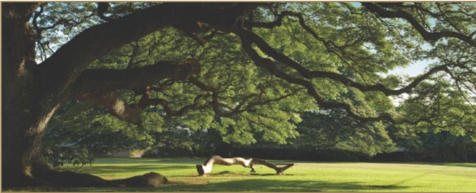
Moanalua Gardens, www.moanalugardens.com

HAWAII'S WOODSHOW™, Na Lā'au o Hawai'i is the annual, juried exhibition where the finest wood artisans meld materials and craftsmanship in recognition of the critical role our forests play in Hawaii's culture, economy, and ecology.