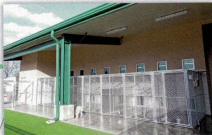
Concrete Runs Outdoors