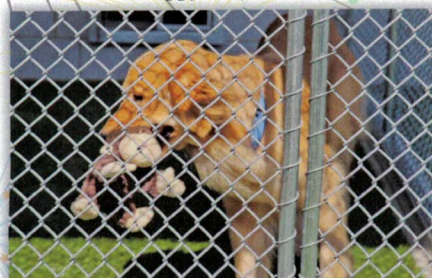
Outdoor Space to Enjoy the Sunshine