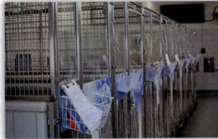
General Population Kennels Indoors