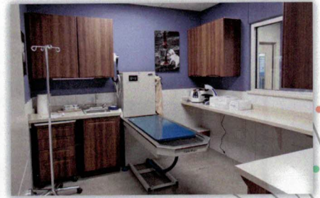
Fully Equipped Medical Room