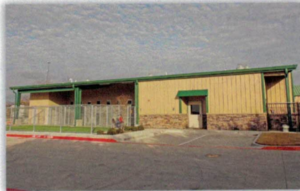
The New Front Entrance...