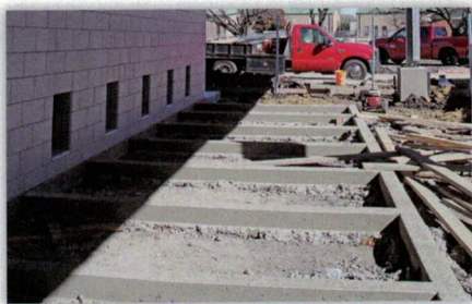
The Beginnings of the Kennels

We would also like to thank everyone who donated to create this wonderful new addition to our campus, as well as everyone who so generously contributed to the equipping of our on-site veterinary medical room. Security remains an ongoing concern, so funding for a security camera system to enable us to provide an added measure of after-hours protection for the dogs is now at the top of our wish list. Enjoy the tour!