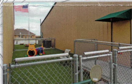
Puppy Play Yard