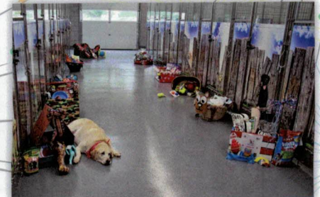
Generous Gifts from Capital One Plano!