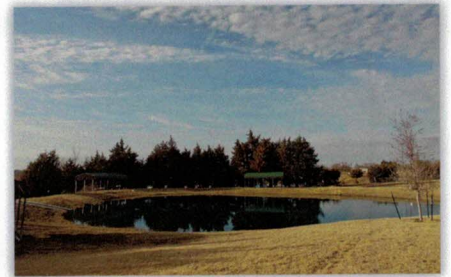
...Pond and View