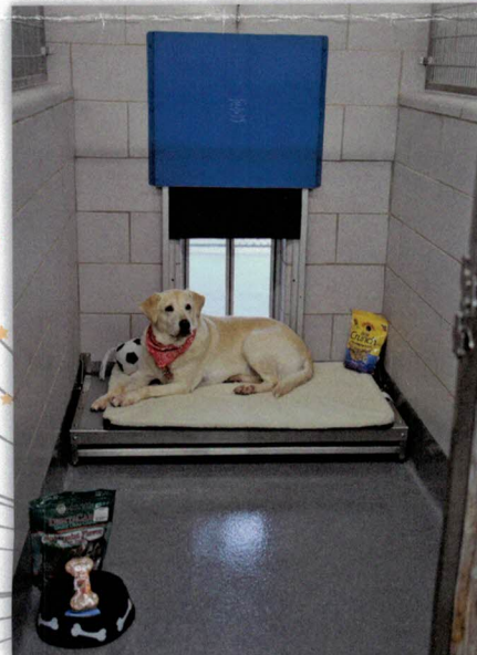
Indoor Space to Live Comfortably