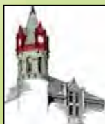
Stoughton Area Senior Center

This series is sponsored by Stoughton Area Senior Center, Stoughton Hospital & Safe Communities