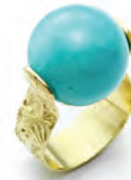
31. Amazonite Spinning Ring 13.77ct Amazonite Ring with 18kt Gold Seascape Band: $3,100