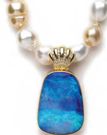
96. Boulder Opal Pendant Boulder Opal with 18kt Gold Scallop Shell and Diamond Pendant: $7,500 (Pendant Only)