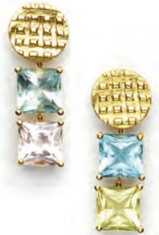
32. 4 Color Beryl Earrings 4 Color Beryl Earrings with 18kt Gold Discs: $6,800