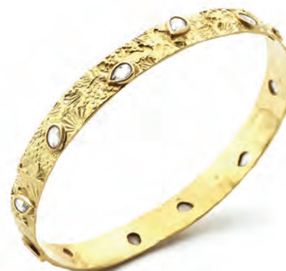
42. Diamond Seascape Bangle 3.71ct Diamond & 18kt Gold textured Seascape Bangle: $12,500