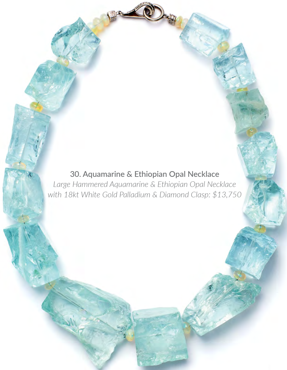
30. Aquamarine & Ethiopian Opal Necklace Large Hammered Aquamarine & Ethiopian Opal Necklace with 18kt White Gold Palladium & Diamond Clasp: $13,750