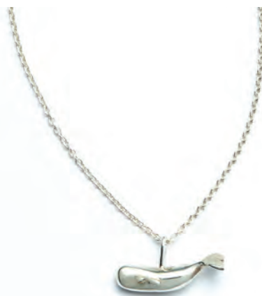
84. Mini Moby Sterling Silver Moby the Magnificent Pendant/Charm: Small: $100 Medium: $175 Large: $375