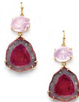
28. Watermelon Tourmaline Earrings 16ct Pink Topaz & Watermelon Tourmaline Earrings: $3,850