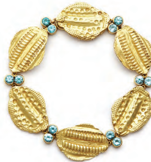
33. Gold Vertebrae Link Bracelet 18kt Gold Vertebrae Link Bracelet set with 6ct Blue Zircon.: $9,350