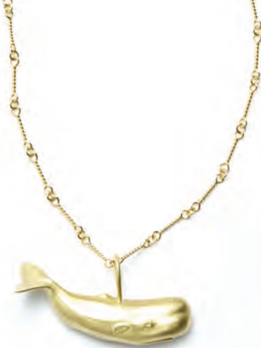
82. Moby the Magnificent 18kt Gold Moby the Magnificent Pendant/Charm: Small: $375 Medium: $1,350 Large: $1,650