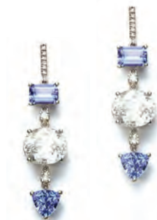
10. Tanzanite & Diamond Earrings Tanzanite, White Zircon & Diamond Earrings: $13,200