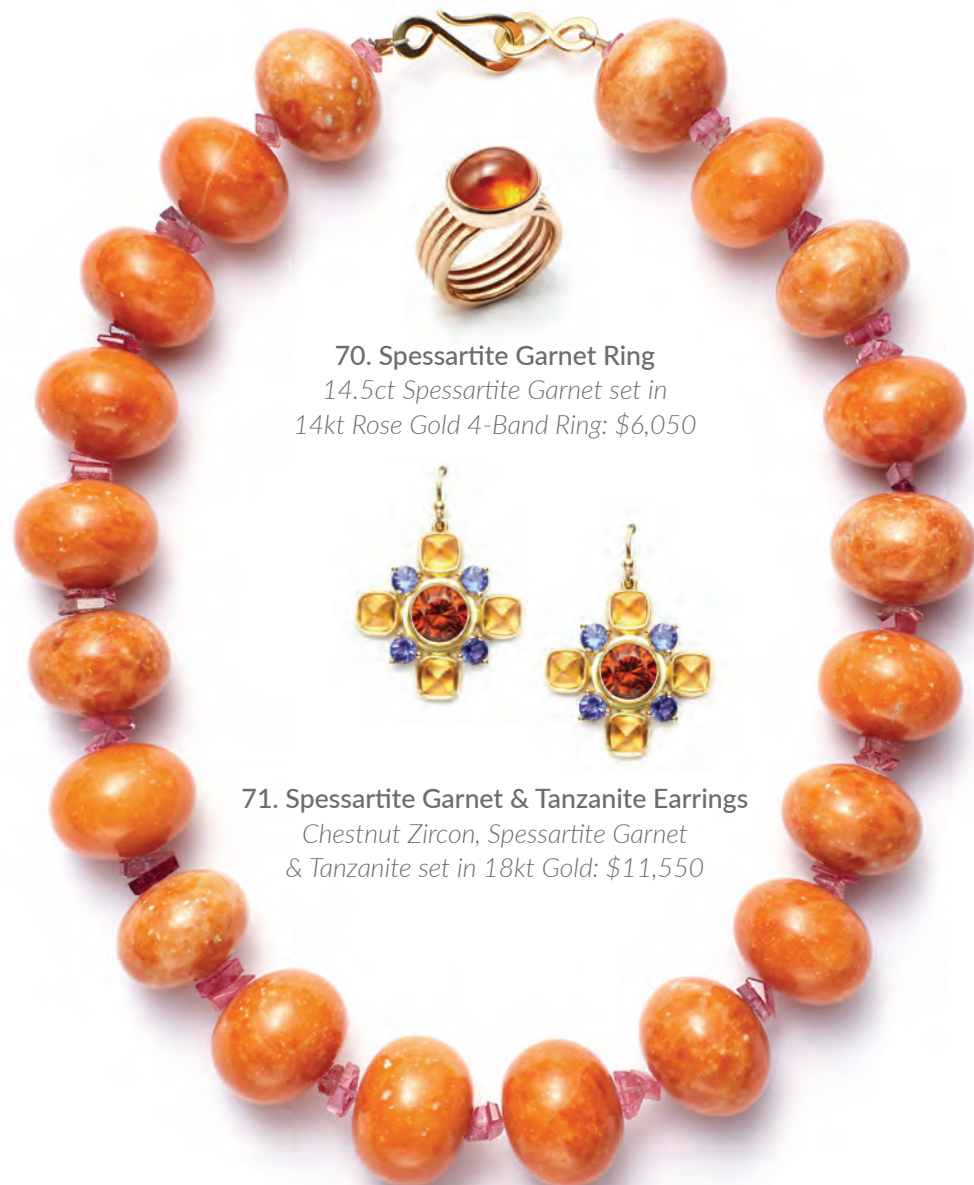
70. Spessartite Garnet Ring

Turquoise & 18kt Gold Necklace with Australian Boulder Opal Clasp: $6,000