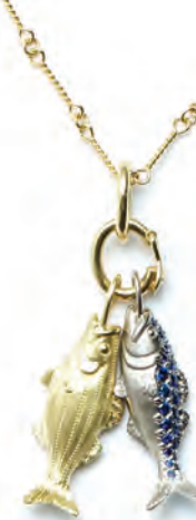
87. Striped Bass Pendant 18kt Gold Striped Bass Pendant: Small: $700; Large: $1,375