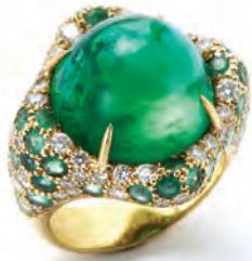
12. Green Tourmaline Ring 17.75ct Green Tourmaline with 1.33ct Diamonds & 2.59ct Emeralds set in 18kt Gold: $13,750