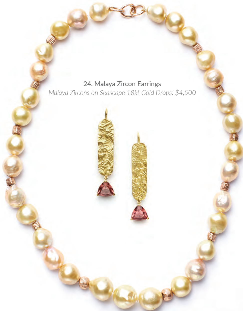
25. South Sea Baroque & Freshwater Pearl Necklace Natural Golden South Sea & Fresh Water Pink Mabe' Pearls with pink, 14kt Rose Gold Beads & 3 ring 14kt Gold Clasp: $11,800