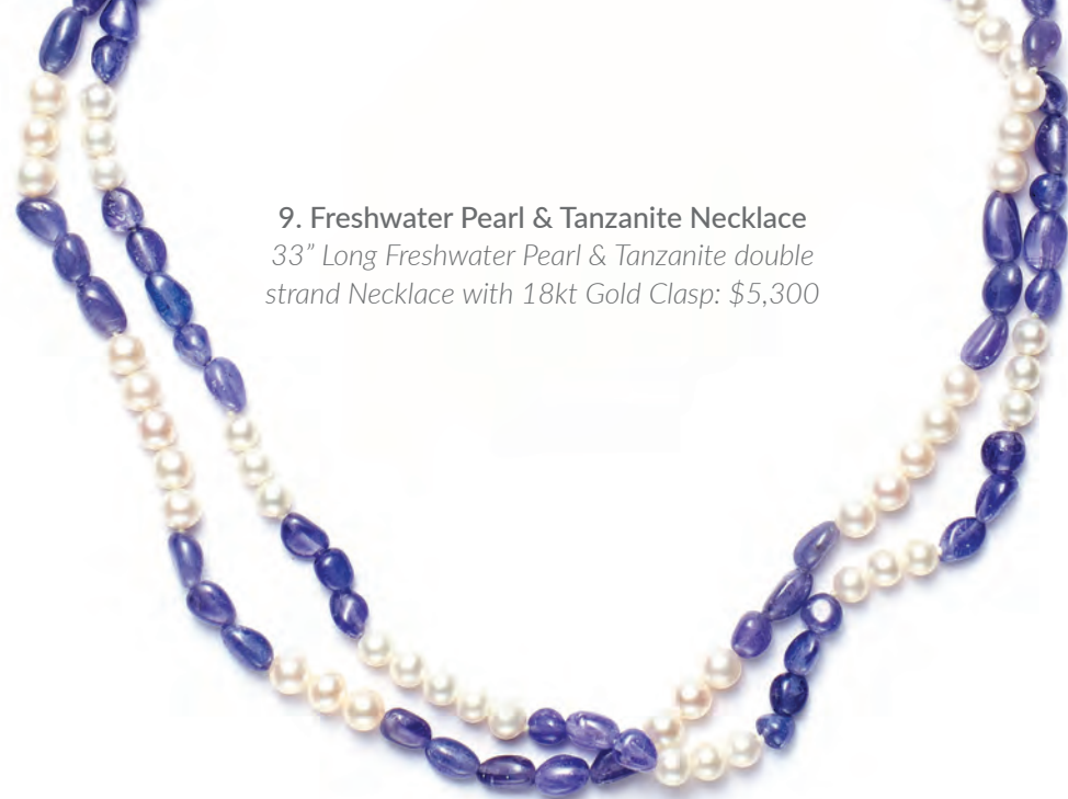
9. Freshwater Pearl & Tanzanite Necklace 33" Long Freshwater Pearl & Tanzanite double strand Necklace with 18kt Gold Clasp: $5,300