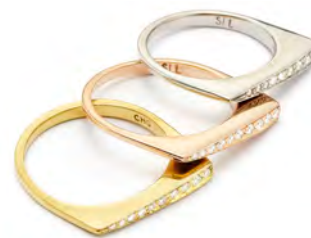
26. Stax Rings Available in 18kt Yellow, Palladium White or Rose Gold with Diamonds: $1,350 (each)