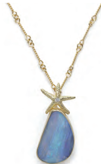
97. Boulder Opal Starfish Pendant Boulder Opal with Starfish and Diamond Pendant: $2,200 (Pendant Only)