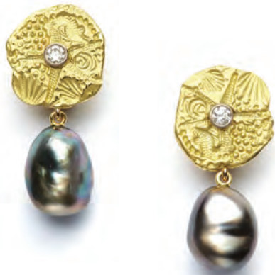
13. Tahitian Baroque Pearl Earrings 18kt Gold Starfish Disc with Diamond & Tahitian Baroque Pearl Earrings: $6,050