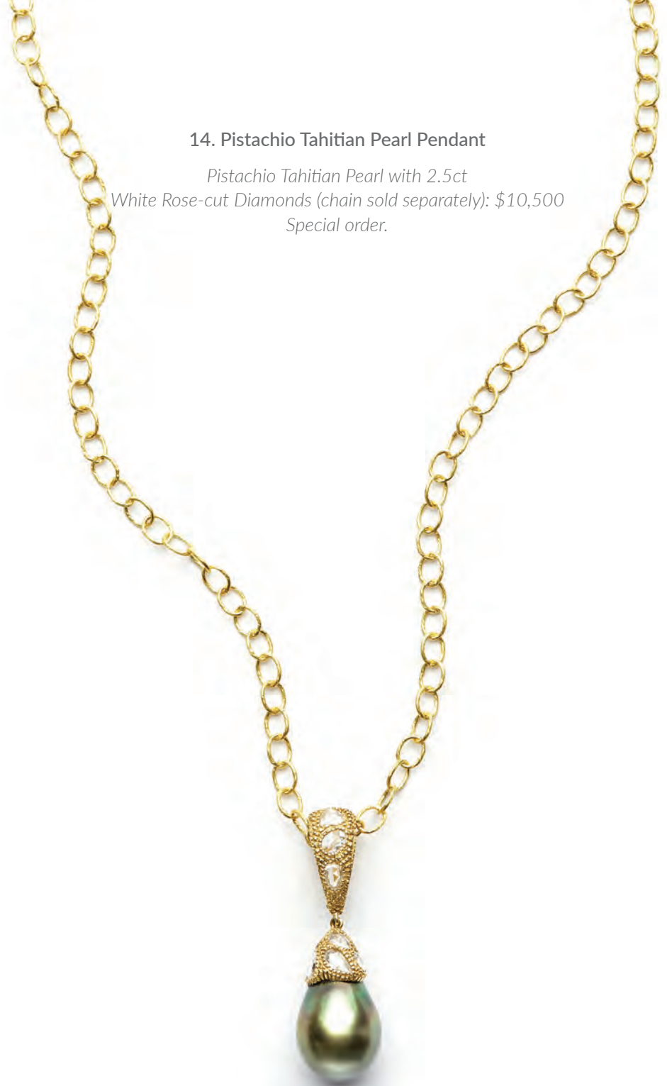
14. Pistachio Tahitian Pearl Pendant

Pistachio Tahitian Pearl with 2.5ct White Rose-cut Diamonds (chain sold separately): $10,500 Special order.