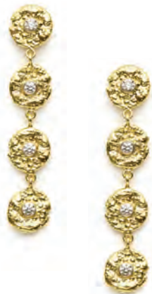
38. "Seaquin" Dangle Earrings 18kt Gold earrings set with 0.47ct Diamonds: $4,950