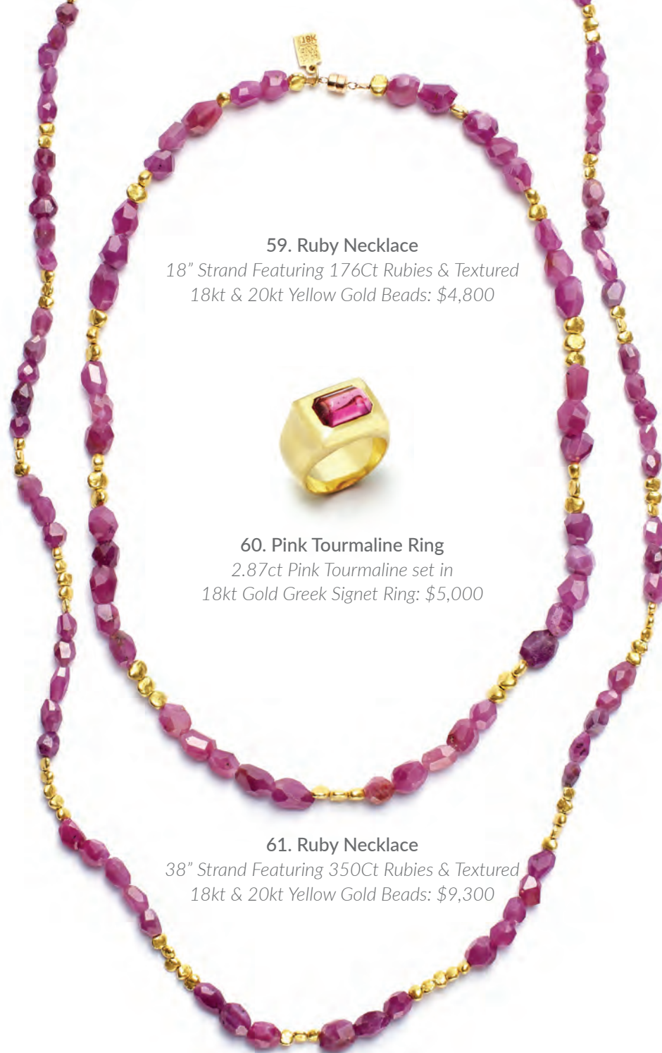
59. Ruby Necklace 18" Strand Featuring 176Ct Rubies & Textured 18kt & 20kt Yellow Gold Beads: $4,800