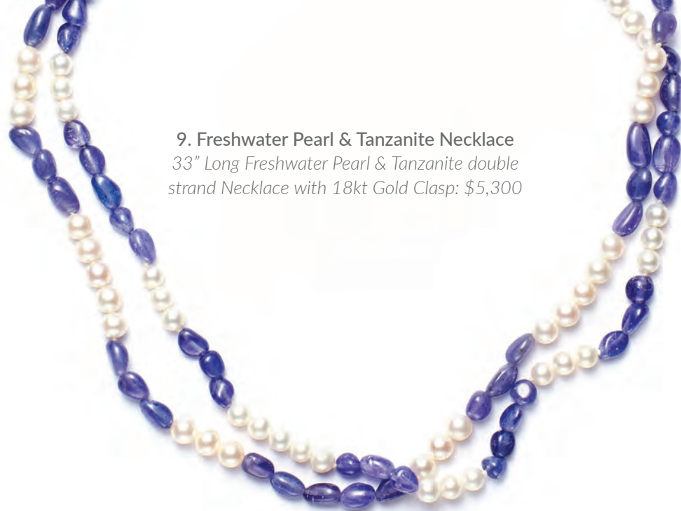
9. Freshwater Pearl & Tanzanite Necklace 33" Long Freshwater Pearl & Tanzanite double strand Necklace with 18kt Gold Clasp: $5,300