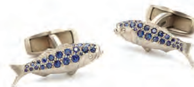
88. Sapphire Bluefish Cufflinks

Available in Sterling Silver & 18kt Gold. Sterling Silver: $750 18kt Gold: $2,750