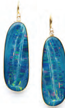
75. Australian Boulder Opal Earrings

Australian Boulder Opal Drops set in 18kt Gold: $2,200