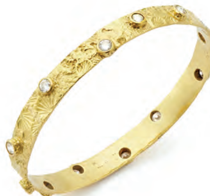
42. Seascape Bangle with Diamonds 3.33ct Diamond & 18kt Gold textured Seascape Bangle: $13,750