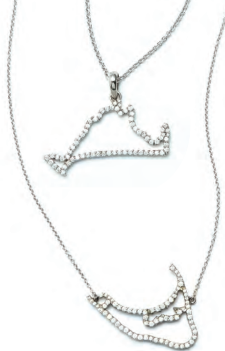
94. Vineyard Map Pendant Large 1ct Diamond Martha's Vineyard Map in 18kt White Gold: $5,300