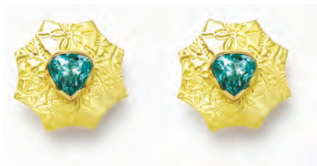
62. Zircon Sand Dollar Earrings 8.73ct Trilliant Cut Blue Zircons set in 18kt Gold Sand Dollar Earrings: $7,150