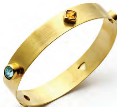
67. Medium Multi Gem Stone Bangle 12mm 18kt Gold Bangle with Spessartite Garnet, Fine Blue Zircon, Pink Tourmaline, Yellow Sapphire & Tanzanite: $8,250