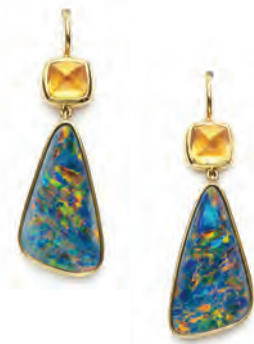
76. Garnet & Opal Earrings

Australian Boulder Opal & Diamonds set in 18kt Gold: $5,700