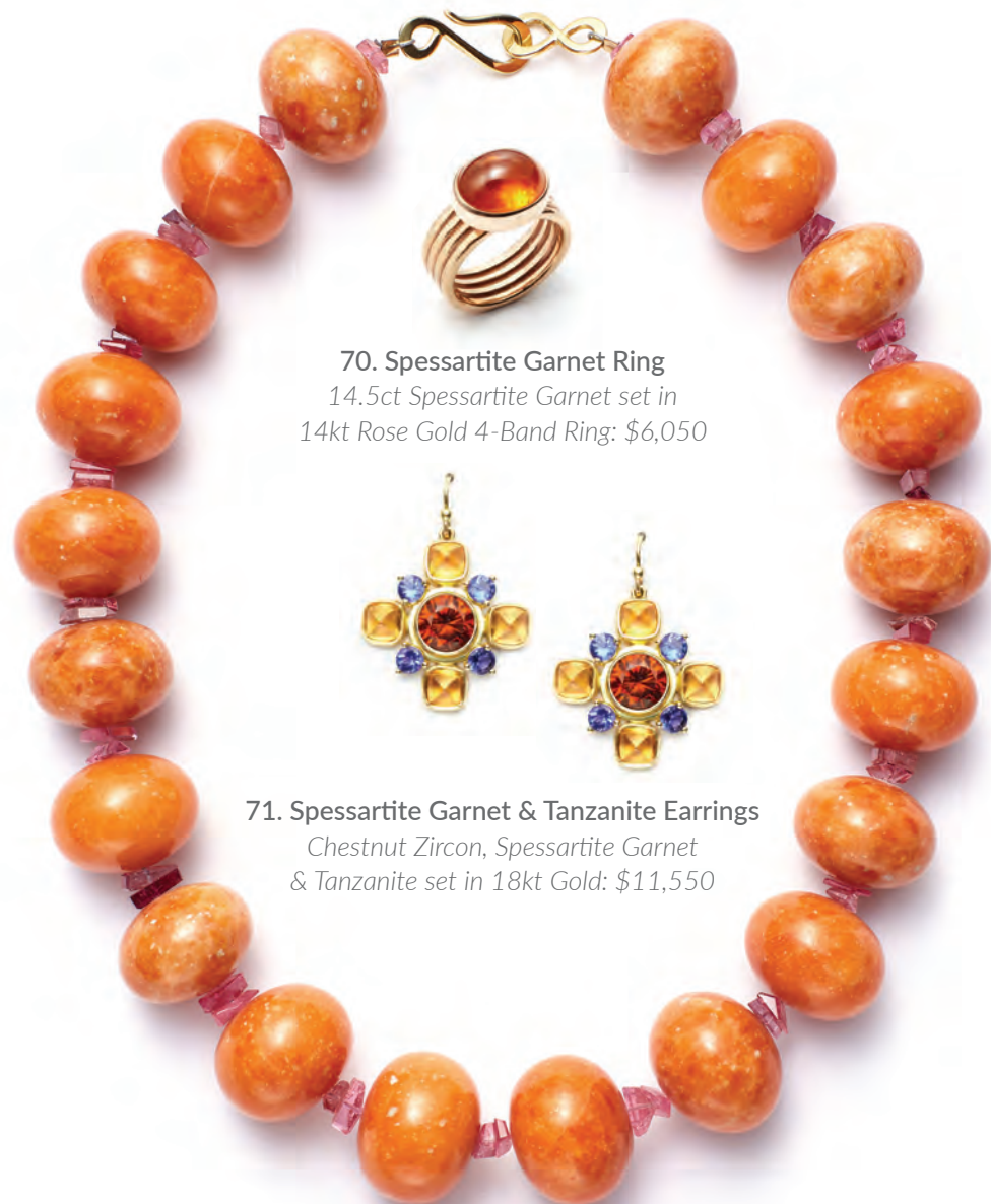
70. Spessartite Garnet Ring

Turquoise & 18kt Gold Necklace with Australian Boulder Opal Clasp: $6,000