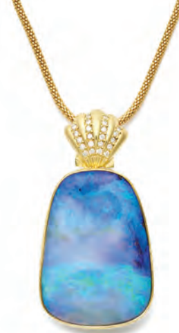
96. Boulder Opal Pendant Boulder Opal with 18kt Gold Scallop Shell & Diamond Pendant: $7,500 (Pendant Only)