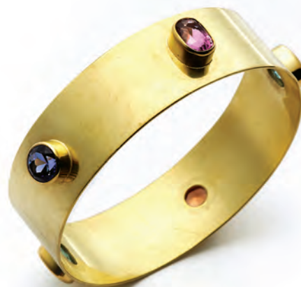
65. Grand Multi Gem Stone Bangle 20mm 18kt Gold Bangle with Orange Garnet, Blue Zircon, Mint Green Tourmaline, Tanzanite & Pink Tourmaline: $10,500