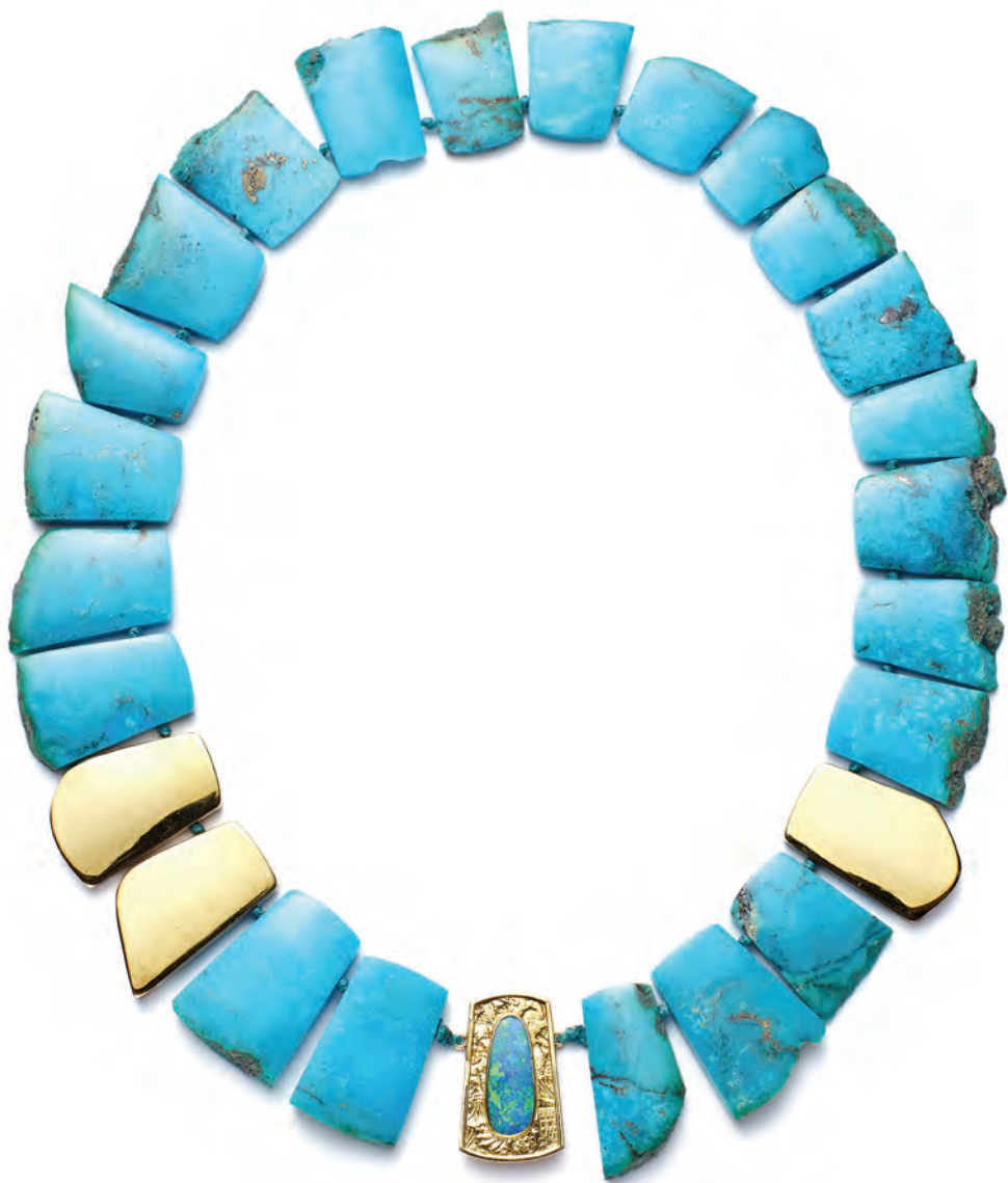
69. Turquoise Plate Necklace

Turquoise & 18kt Gold Necklace with Australian Boulder Opal Clasp: $6,000