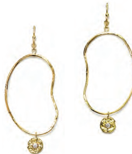
35. Oyster Earrings 18kt Gold Earrings with Diamonds set in "Seaquin" drops: $2,000