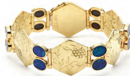
77. Cherry Blossom Link Bracelet

2.42ct Spessartite Garnets & Australian Boulder Opals set in 18kt Gold: $3,100