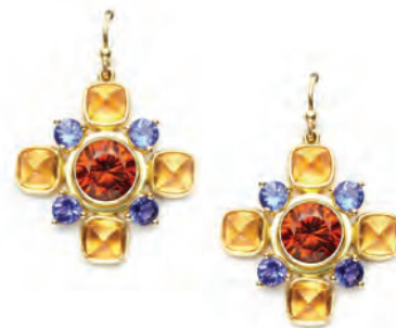
71. Spessartite Garnet & Tanzanite Earrings

14.5ct Spessartite Garnet set in 14kt Rose Gold 4-Band Ring: $6,050