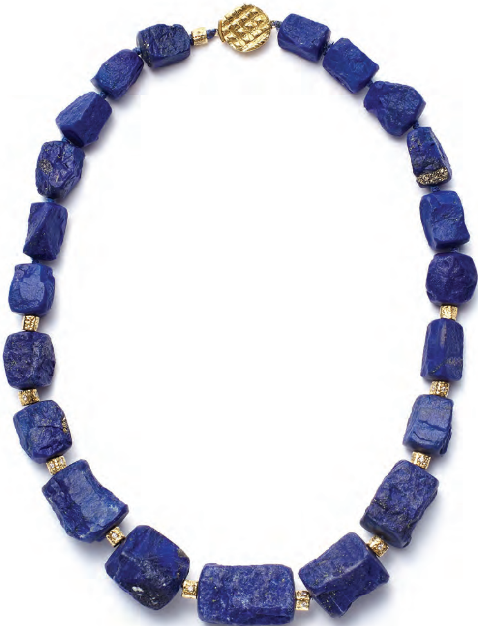
73. Hammered Afghani Lapis Lazuli Necklace

Hammered Lapis Lazuli Necklace with 18kt Gold Beads & Clasp: $7,150