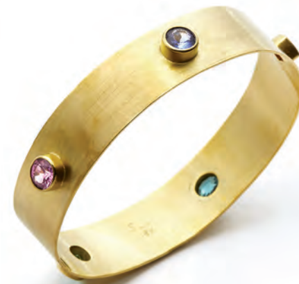
66. Large Multi Gem Stone Bangle 16mm 18kt Gold Bangle with Spessartite Garnet, Zircon, Mint Green Tourmaline, Spinel & Tanzanite: $9,300