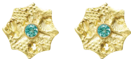
64. Apatite Sea Urchin Earrings 1.5ct Apatite set in 18kt Gold Sea Urchin Earrings: $3,850