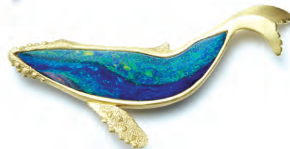
11. Happy The Humpback Whale Pin Australian Opal set in 18kt Gold: $6,500