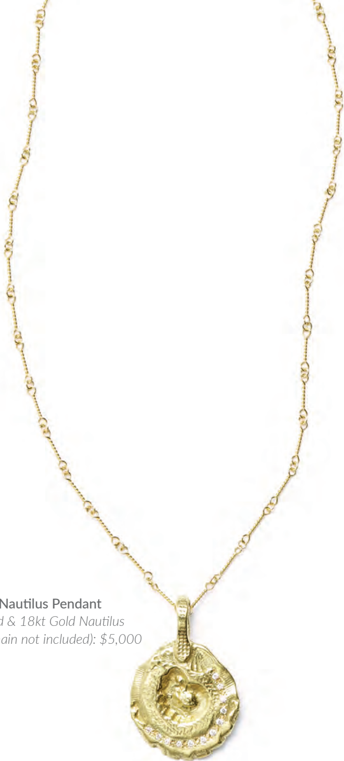
34. Nautilus Pendant Diamond & 18kt Gold Nautilus Pendant (chain not included): $5,000