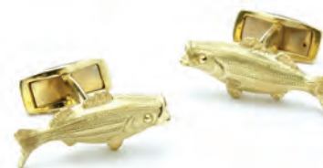
89. Striped Bass Cufflinks

Sapphire & 14kt White Gold Bluefish Cufflinks: $6,800