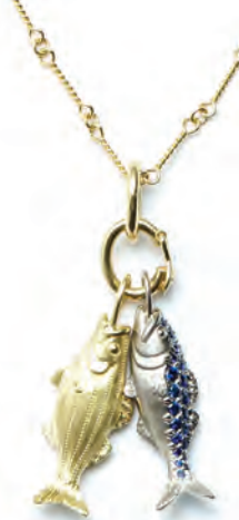
87. Striped Bass Pendant

18kt Gold Striped Bass Pendant: Small: $700; Large: $1,375