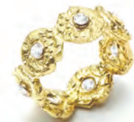
36. "Seaquin" Ring 0.40ct Diamond & 18kt Gold "Seaquin" Ring: $3,850