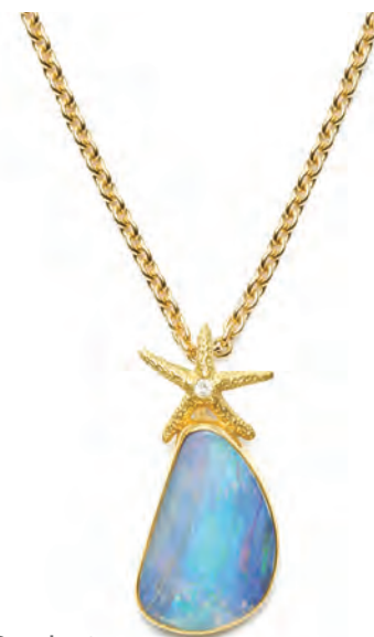
97. Boulder Opal Starfish Pendant Boulder Opal with Starfish & Diamond Pendant: $2,200 (Pendant Only)