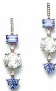
10. Tanzanite & Diamond Earrings Tanzanite, White Zircon & Diamond Earrings: $13,200