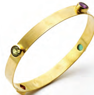
68. Narrow Multi Gem Stone Bangle 8mm 18kt Gold Bangle with Paraiba Tourmaline, Green Garnet, Spessartite Garnet & Pink Sapphire: $7,150