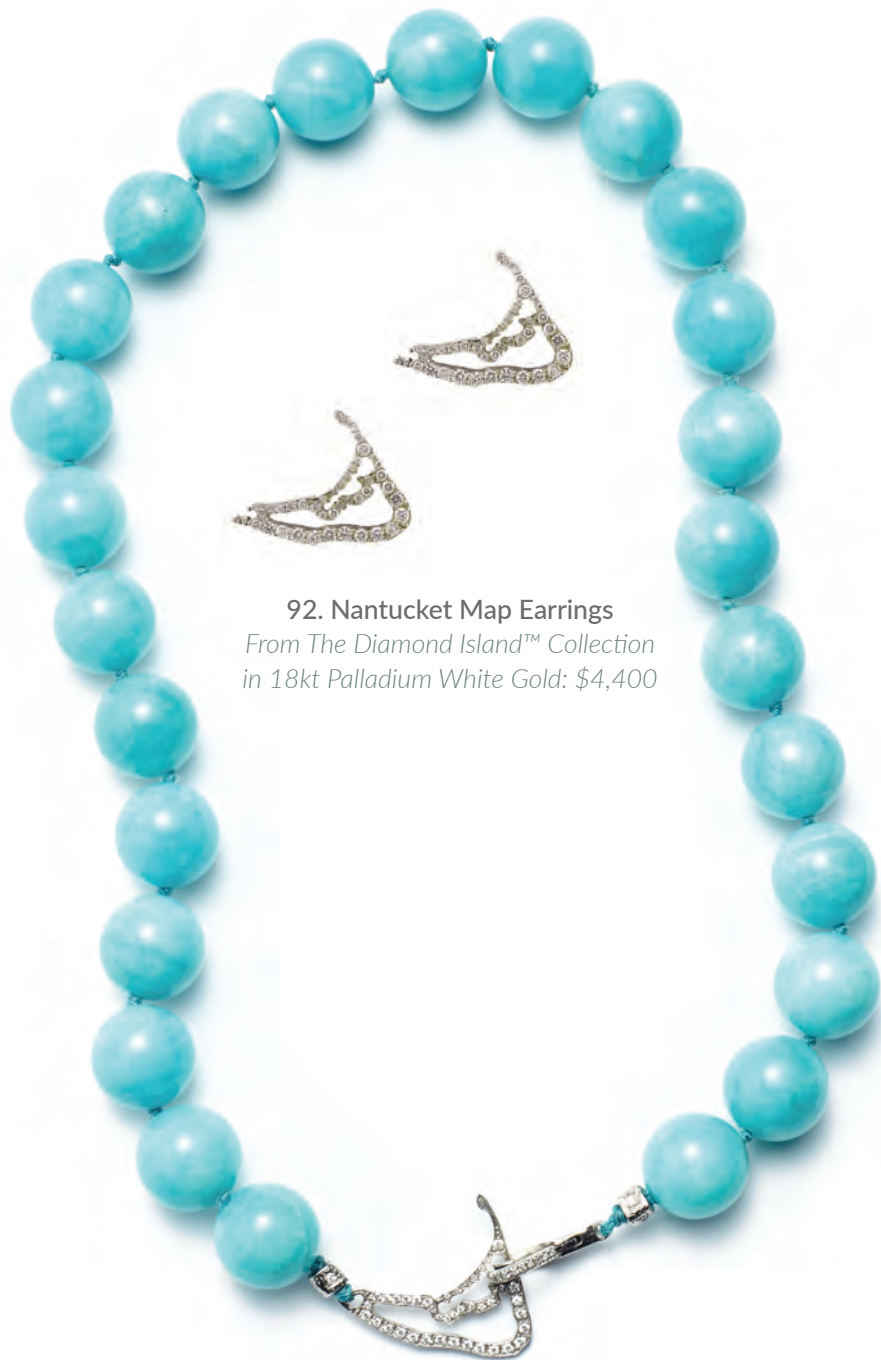
92. Nantucket Map Earrings From The Diamond Island™ Collection in 18kt Palladium White Gold: $4,400