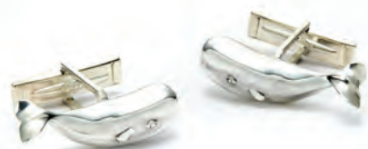
83. Moby the Magnificent Cufflinks

18kt Gold Striped Bass Pendant: Small: $700; Large: $1,375