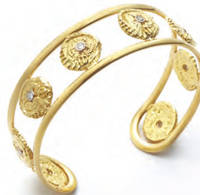
37. "Sea Star" Cuff "Seaquin" 18kt Gold Cuff Bracelet with Diamonds: $8,250