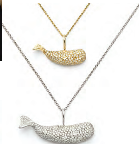
84a. "Moby in the Middle" with Pavé Diamonds

Moby in the Middle is looking festive in 18kt Yellow Gold with Pavé Diamonds: $2,500