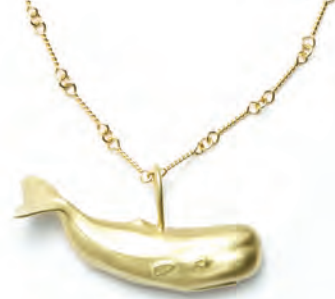
82. Moby the Magnificent 18kt Gold Moby the Magnificent Pendant/Charm: Small: $375 Medium: $1,350 Large: $1,650