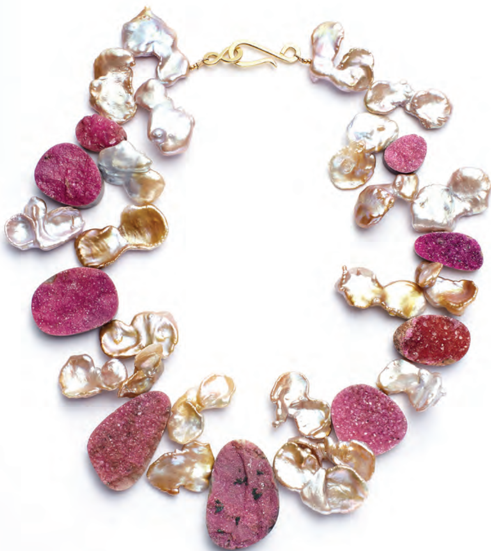
58. Colbato Calcite Druzy Necklace Colbato Calcite Druzy with Double Keshi Pearls: $2,750