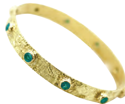
41. Paraiba Seascape Bangle 4.68ct Brazilian Paraiba Tourmaline set in an 18kt Gold textured seascape bangle: $12,500