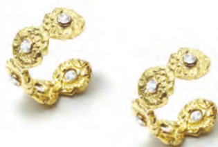
39. "Seaquin" Hoop Earrings 0.56ct Diamond & 18kt Gold "Seaquin" Hoop Earrings: $4,500