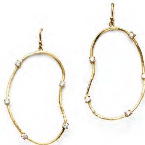
40. Oyster Earrings with Diamonds 0.33ct Diamond & 18kt Gold Oyster Earrings: $2,500