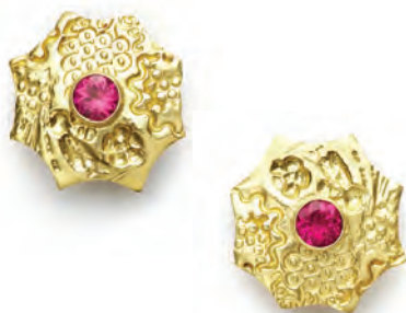
63. Rubellite Earrings 1.6ct Rubellite set in 18kt Gold Sea Urchin Earrings: $4,500