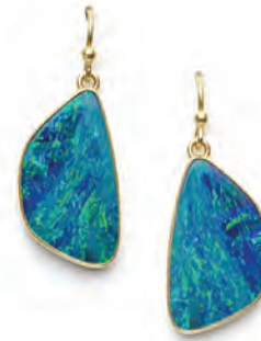
74. Australian Boulder Opal Drops

Hammered Lapis Lazuli Necklace with 18kt Gold Beads & Clasp: $7,150