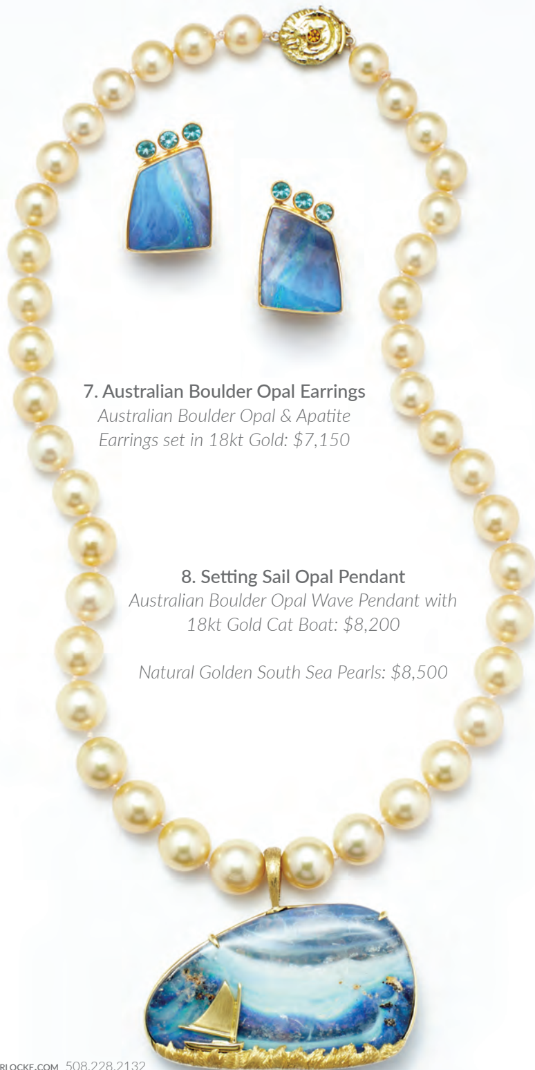
7. Australian Boulder Opal Earrings Australian Boulder Opal & Apatite Earrings set in 18kt Gold: $7,150