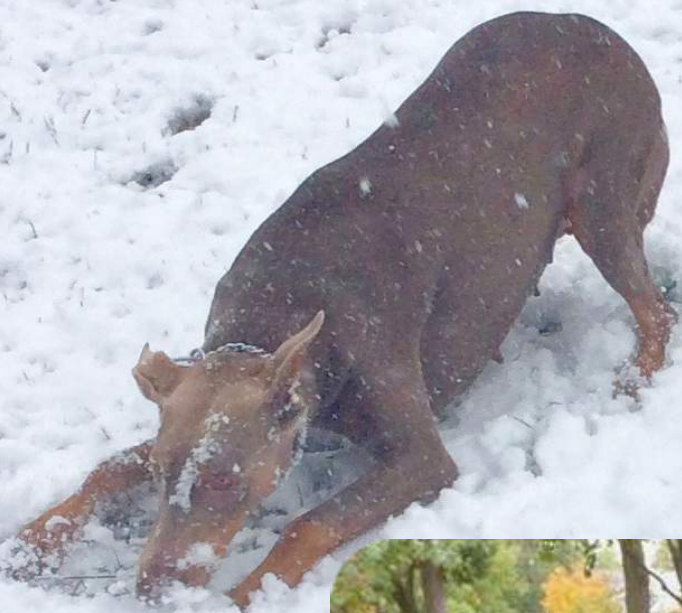
"GRACIE" IN ILLINOIS LOVES WHEN IT SNOWS