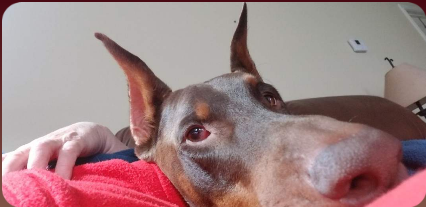
"BRICK" IN TEXAS ABOVE