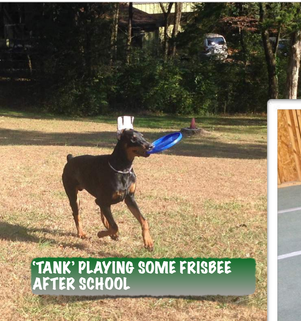
'TANK' PLAYING SOME FRISBEE AFTER SCHOOL