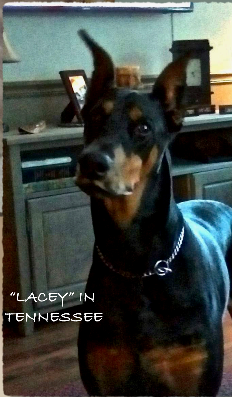
"LACEY" IN TENNESSEE