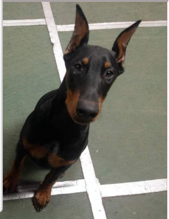
'MINDA' WORKING ON HER STAYS