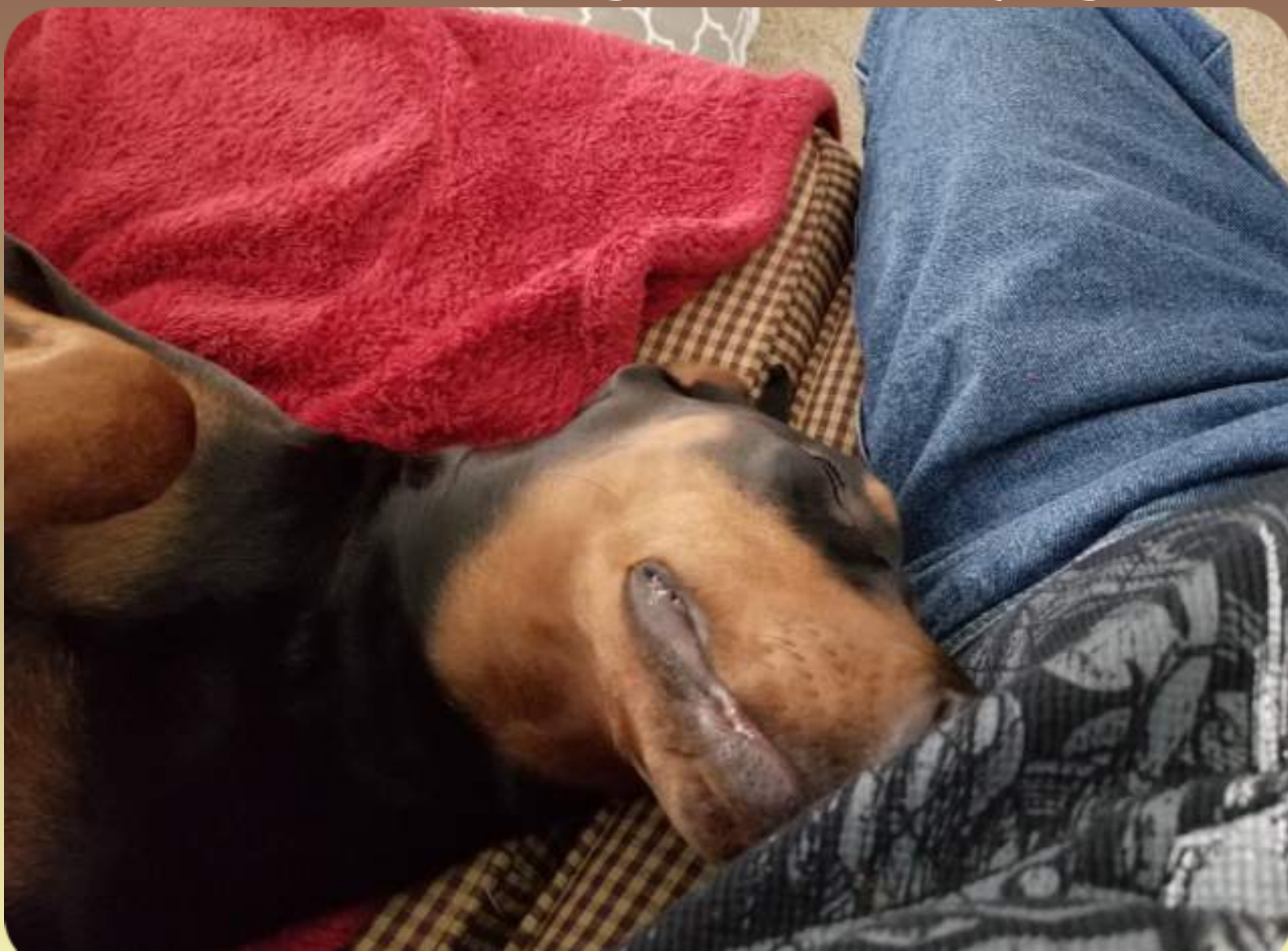
"DIESEL" IN INDIANA BELOW