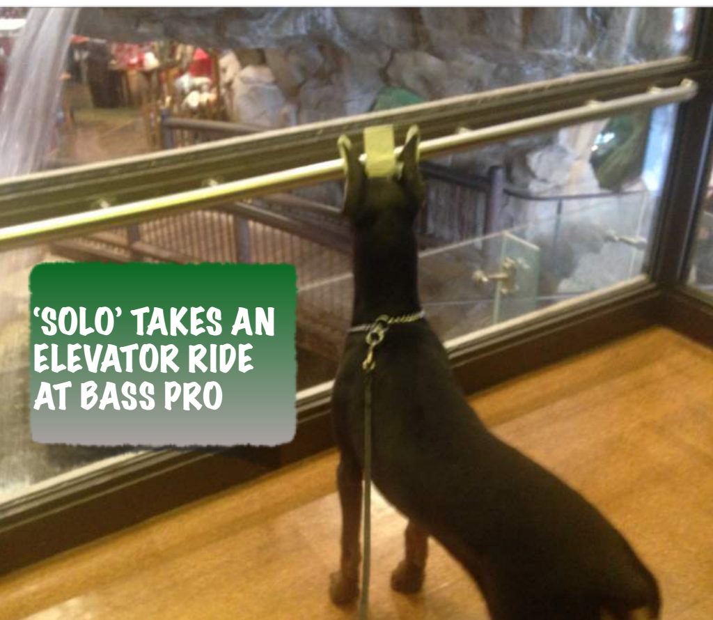
'SOLO' TAKES AN ELEVATOR RIDE AT BASS PRO