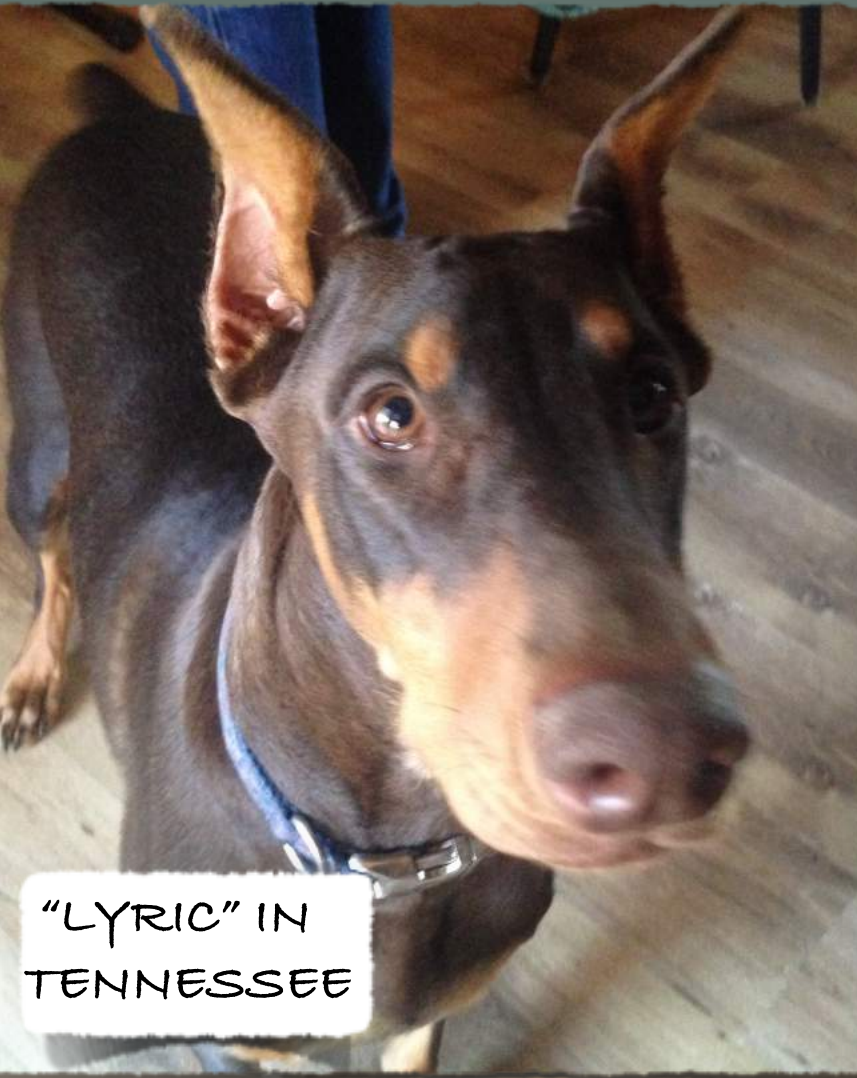
"LYRIC" IN TENNESSEE