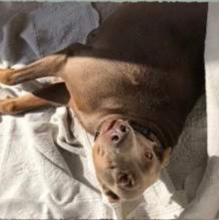
'GRACIE' IN ILLINOIS