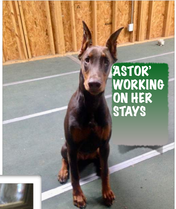
'ASTOR' WORKING ON HER STAYS