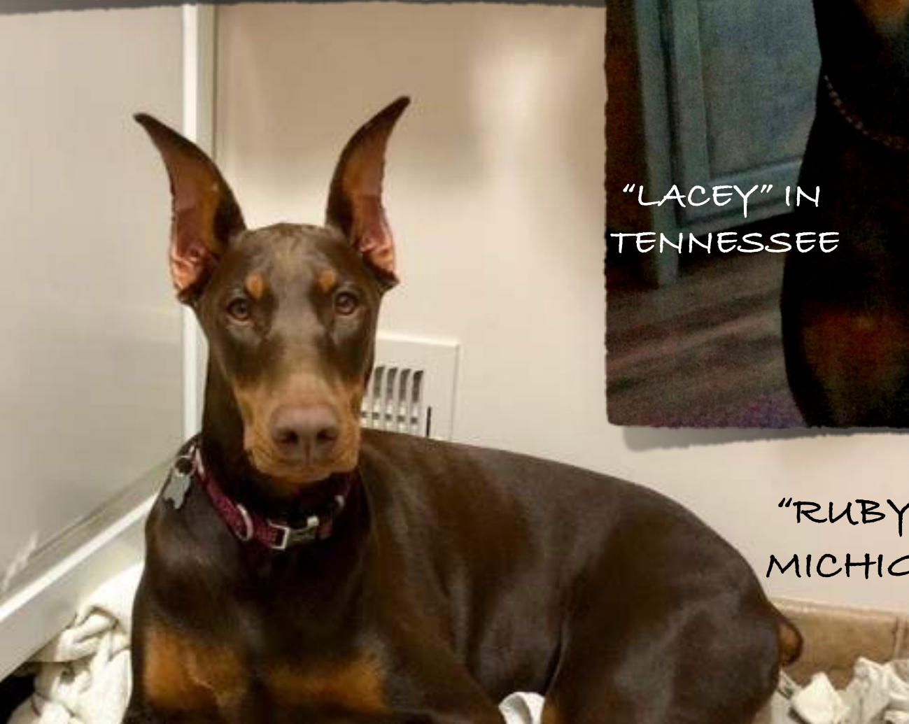
"RUBY" IN MICHIGAN