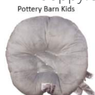
Pottery Barn Kids