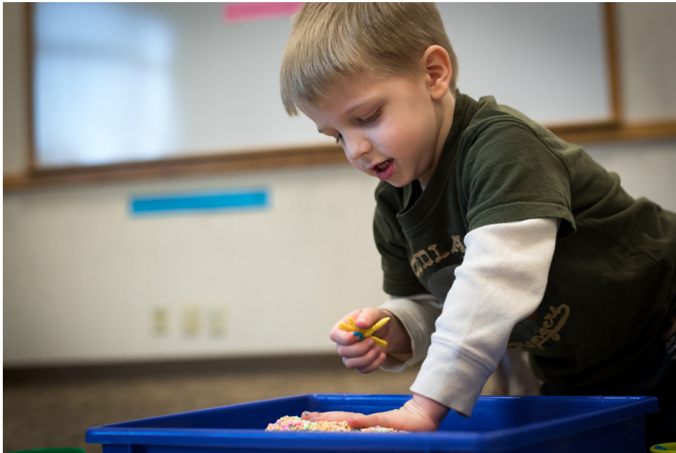
A participant in our Elyria Teach Me to Play program experiences sensory play with props.