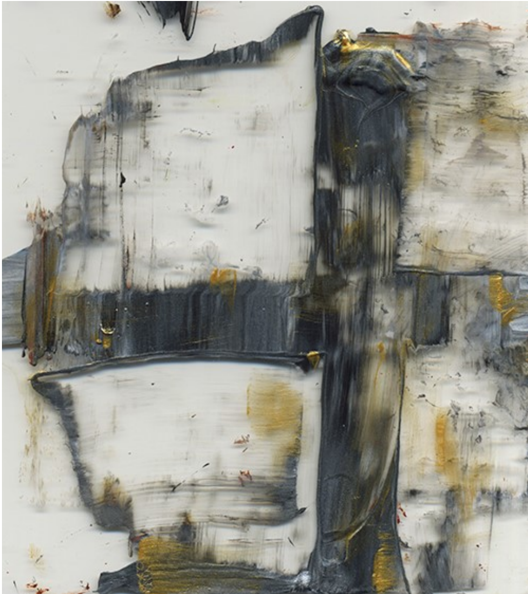
Blessing the Dust