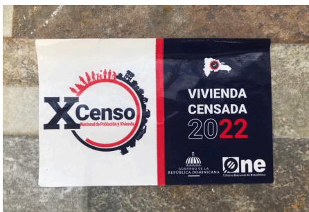
Large sticker put on the front of our house by the census lady after finishing her interview!