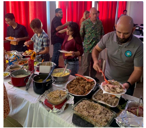
Thanksgiving dinner sponsored by missionaries, with seminary families and residents of Good Shepherd group home.