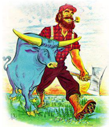
© Bang Printing, drawings by Homer Dimmick