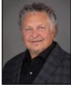
Bleu Cotton Speakers Director