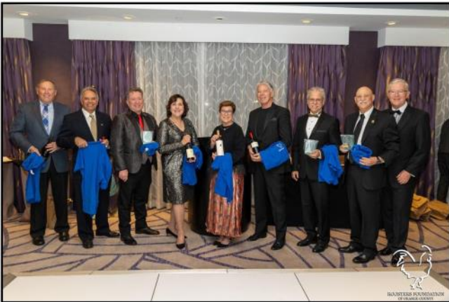
The 2023 Board