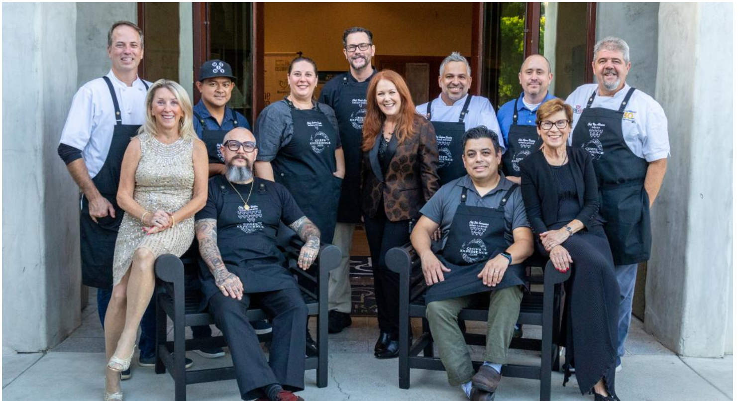
Our Heroes from Roosters Chefs Experience 2025

SG DRE #00745605. This is not intended to be a solicitation of another broker's listing.