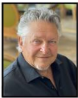
Bleu Cotton Speakers Chair