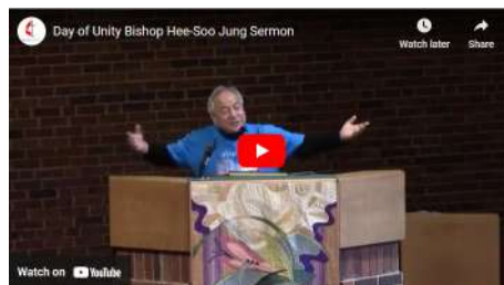
PLAY BISHOP JUNG'S SERMON