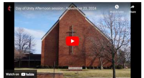
PLAY PM SERVICE VIDEO