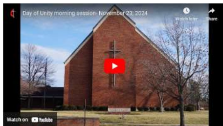
PLAY AM SERVICE VIDEO