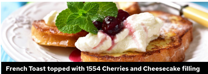
French Toast topped with 1554 Cherries and Cheesecake filling

Nothing warms up your taste buds quite like a helping, or two, of savory apples. Top quality sliced apples seasoned with cinnamon sugar. These apples are perfect as a side dish, for breakfast or dinner, or even as a dessert.