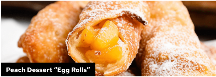
Peach Dessert "Egg Rolls"