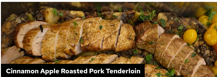
Cinnamon Apple Roasted Pork Tenderloin