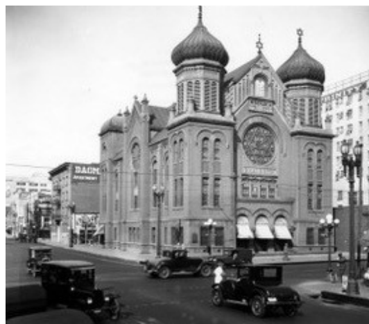
Temple B'nai Brith in Los Angeles, built in 1862 A PJTC Centenary Project