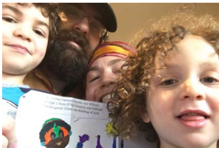
Making cards for seniors in the community.