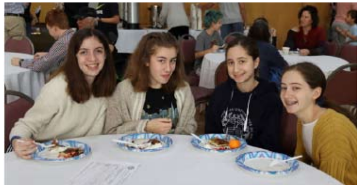
Happy USYers eating pancakes with gusto!