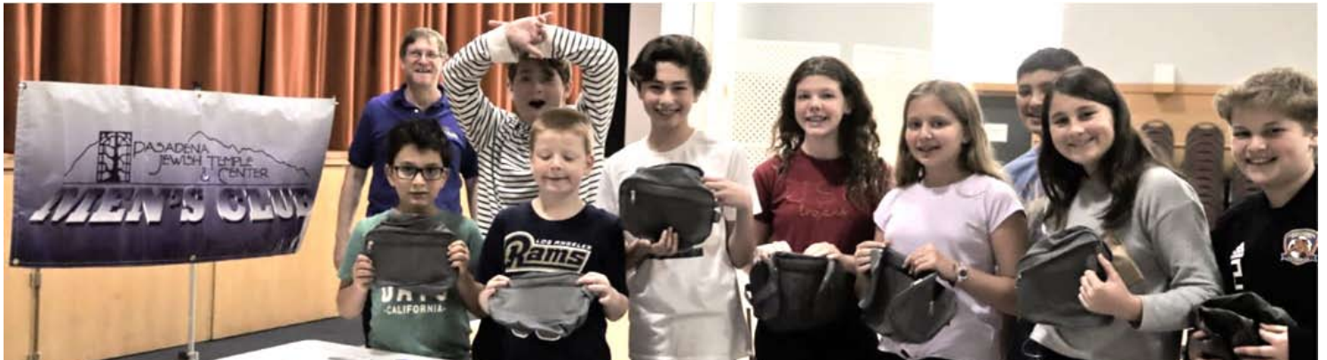
Mitzvah Day – participants put together toiletry kits for the Gooden Center.