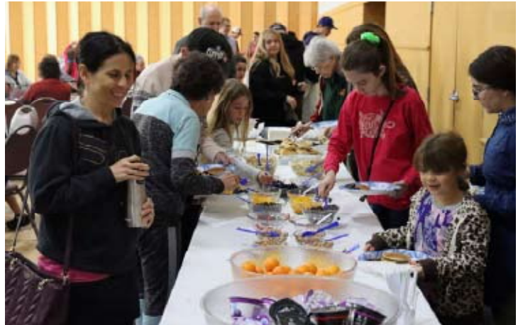
Kids, parents, community members line up for pancakes before sea ice talk.