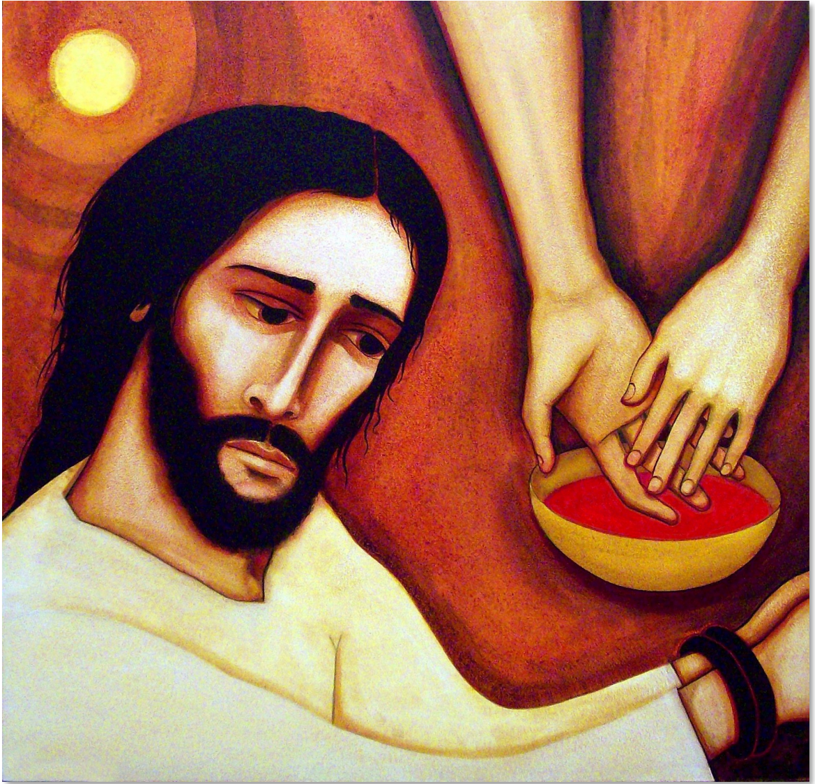
5th Biblical Station. Jesus is condemned by Pilate.