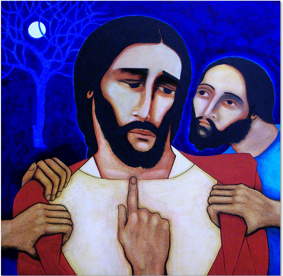
2 nd Biblical Station. Jesus is betrayed and arrested.