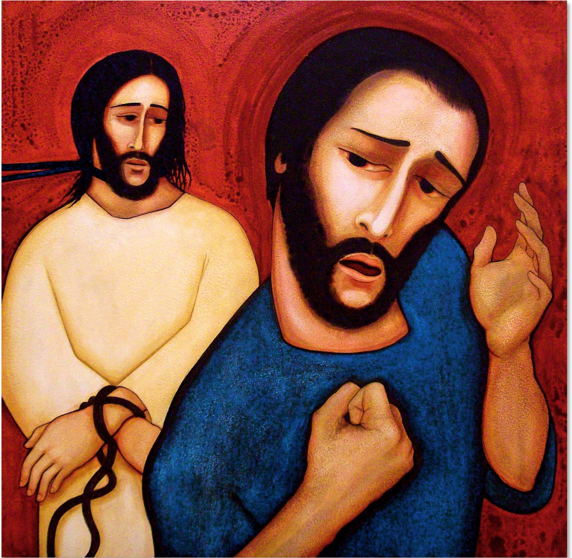
4th Biblical Station. Peter denies knowing Jesus.