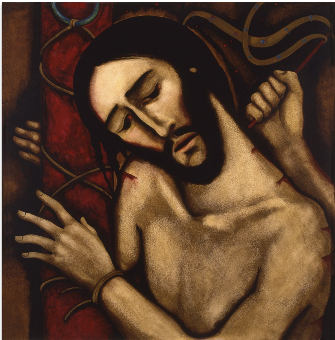
6th Biblical Station. Jesus is scourged and crowned with thorns.