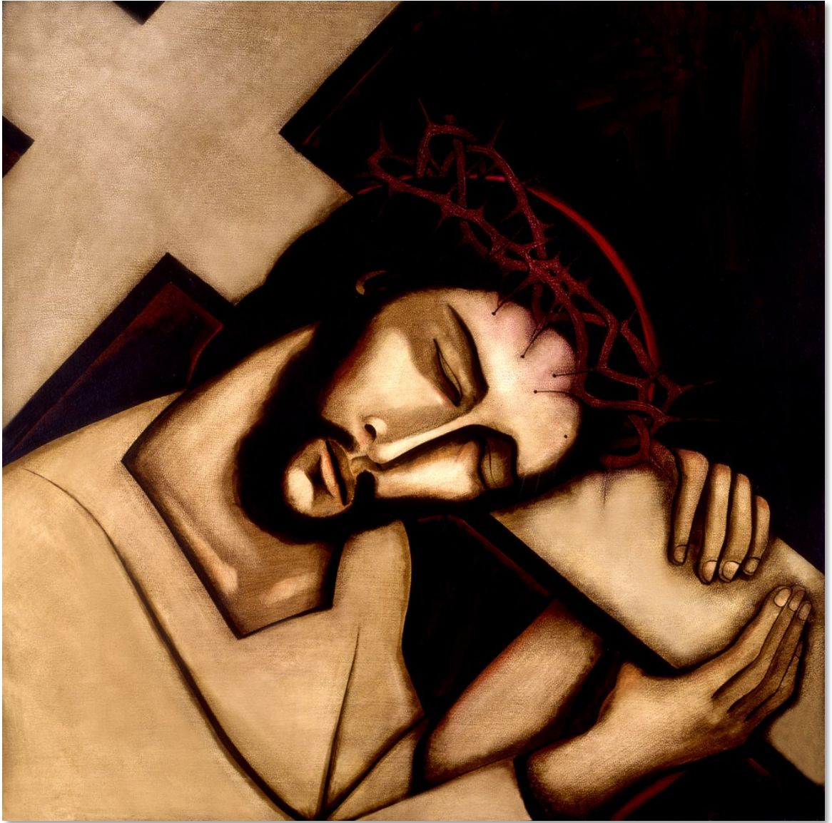
7th Biblical Station. Jesus takes up his cross.