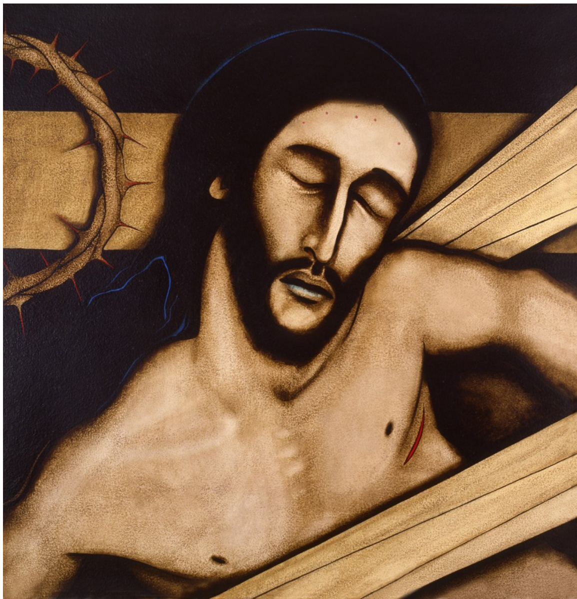
13th Biblical Station. Jesus dies.