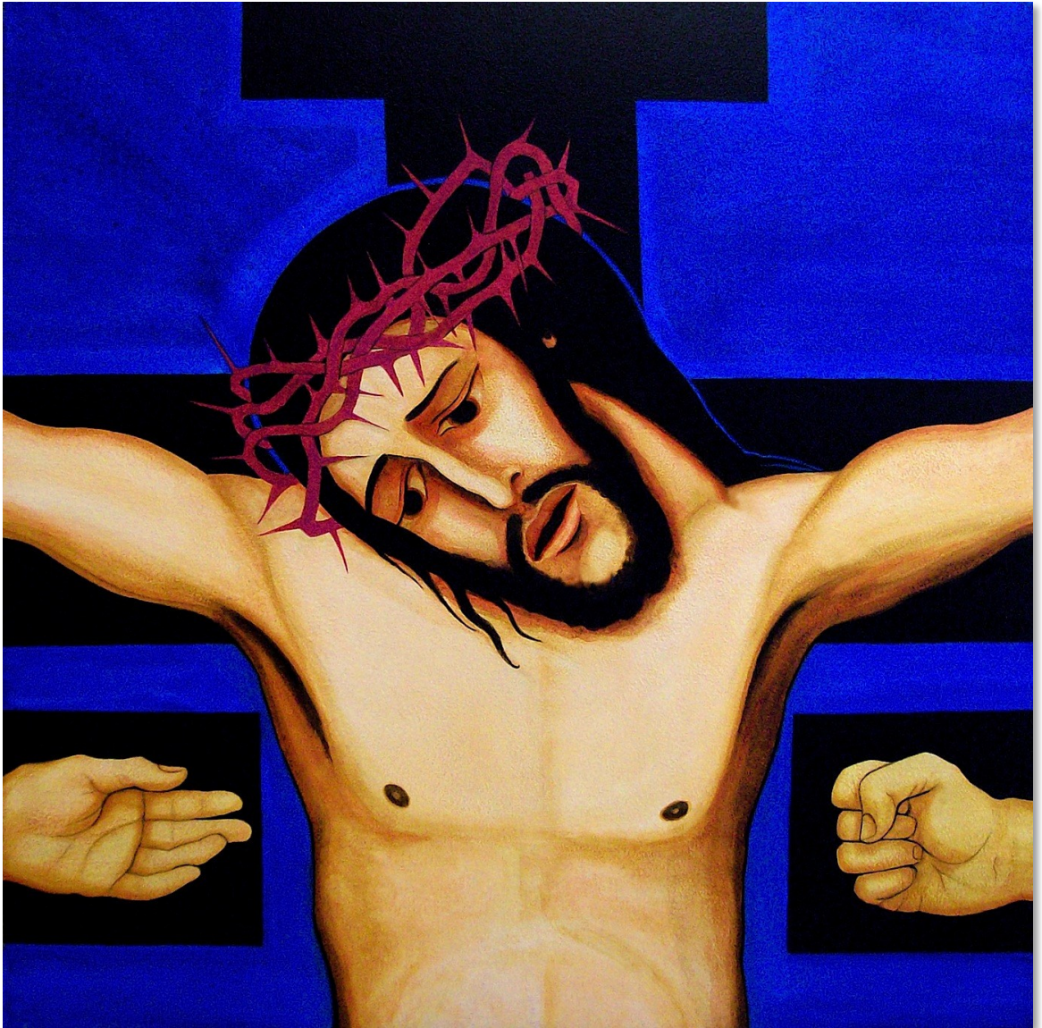
10th Biblical Station. Jesus is Crucified.