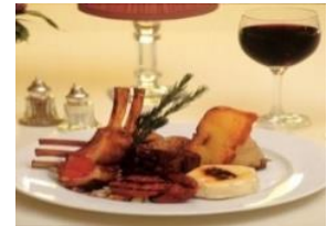
Dinner is served