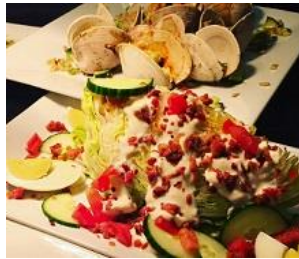
Grilled Cucumber & Scallions, Clams, and Wedge Salad

New Brunch Packages Great for Baby and Bridal Showers