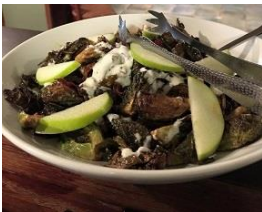
Brussel sprouts with an apple cider reduction tossed with bacon served with sliced Granny Smith apples and crème fraiche

Save 20% at Cal's. through Saturday Mention the promotion for the discount. Not applicable with other discounts or promotions.