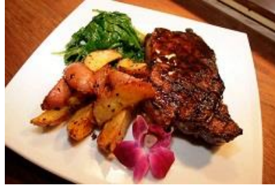
Steak dinner with fries

350 Worthington St. Springfield, MA 01109 413.439.0666