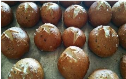
Homemade pretzel rolls