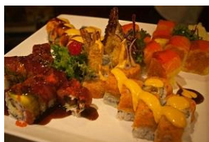
Red Dragon Roll