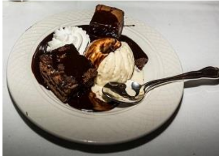
One of many delicious desserts at Hofbrauhaus

1105 Main Street West Springfield, MA 01089 413.737.4905