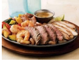
The Ultimate Fajita

33 Border Way West Springfield, MA 01089 413.304.3500 19 Commerce Way Woburn, MA 01801 781.995.2314