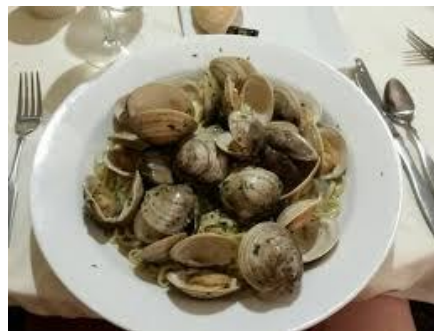
Come in for some Steamers!!!

782 Center Street Ludlow, MA 01056 413.547.6443