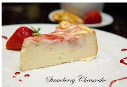
Our own Strawberry Cheesecake

664 North Main Street East Longmeadow, MA 01028 413.732.9300