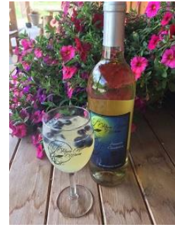
White Raven Lemonade with blueberries