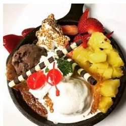
Banana Split Clafouti

135 Cooper St. Agawam, MA 01001 413.789.1267