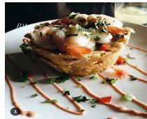
Mofongo con Camerones

1168 Boston Road Springfield, MA 01119 413.363.2354