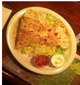
Buffalo Chicken Quesadilla

Céad Míle Fáilte! (A hundred thousand welcomes)