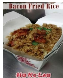
Bacon Fried Rice

705 Memorial Drive Chicopee, MA 01020 413.593.5222