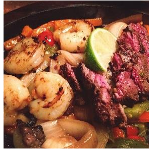
Steak and Shrimp Fajitas