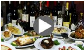
Banquet room is available For private functions

At Casa we take pride in the art of cooking. All our dishes are made only with the finest ingredients and cooked to order. So sit back, relax and enjoy all we have to offer!