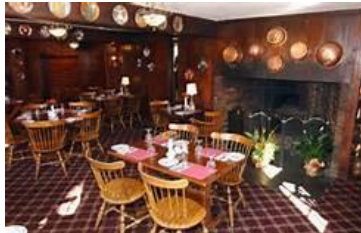
A cozy setting for lunch or dinner

1305 Memorial Avenue West Springfield, MA 01089 413.732.4188