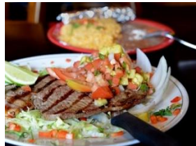
Carne Asada with pineapple pico de gallo

Mi Tierra Tortillas...We make tortillas with no chemicals, no additives, just 100% corn as our forefathers intended