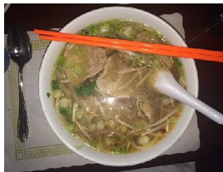
Beef, meatball and brisket pho