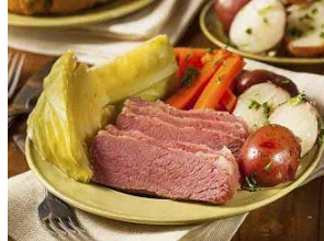
Corned Beef and Cabbage

Céad Míle Fáilte! (A hundred thousand welcomes)