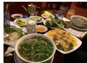
a variety of dishes

What is Pho? A traditional Vietnamese broth soup serve with meats and herbs, a staple in Vietnamese cooking