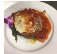
Stuffed pork chop over broccoli rabe, pepperjack cheese and tomatoes

For December Free Birthday Dinner On your birthday, enjoy a Free Dinner (be sure to have your ID)