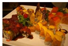
Red Dragon Roll

Appy Hour Mon. - Thurs. 3:30 - 5:30 Open on Thanksgiving