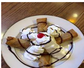
Be sure to save room for dessert