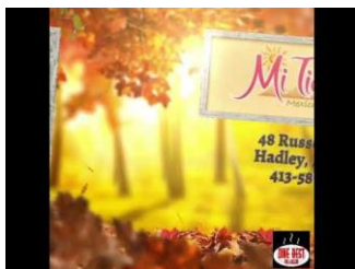
click for video

Holidays are coming up!! Make your reservations