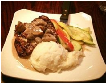
Grilled top sirloin steak with Yukon potatoes and fresh market vegetables

Serving Lunch menu on Saturdays 12 – 3 pm