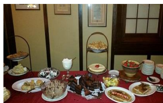
Desserts on the buffet table

1105 Main Street West Springfield, MA 01089 413.737.4905