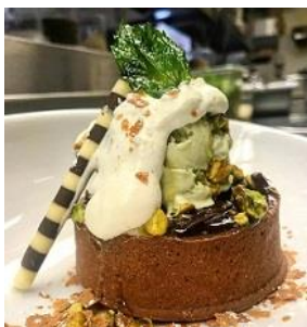
Chocolate marscapone tart with pistachio gelato and sea salt

135 Cooper St. Agawam, MA 01001 413.789.1267