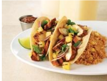
Anchiote Chicken Tacos

33 Border Way West Springfield, MA 01089 413.304.3500 19 Commerce Way Woburn, MA 01801 781.995.2314