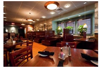
Video: Click here

Limited Luncheon Package 20 person Minimum